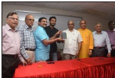
The launch of the Red Cross App in the State

The state branch organised state level JRC and YRC camps in various parts of the state.