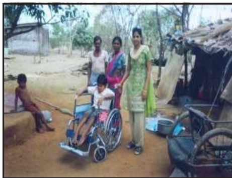
Wheelchair donated to the poor child