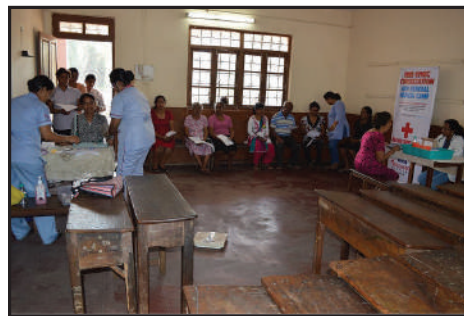
Free Gynaecology session in a school