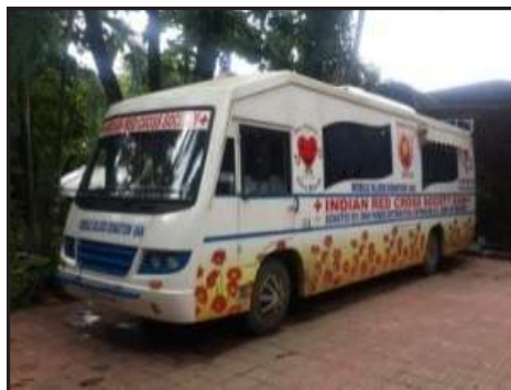
The Ambulance of the state branch

Secretary of this branch has been awarded Bharat Gaurav Award for his personal feats in the field of social service.