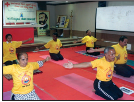
International Yoga Day celebrated