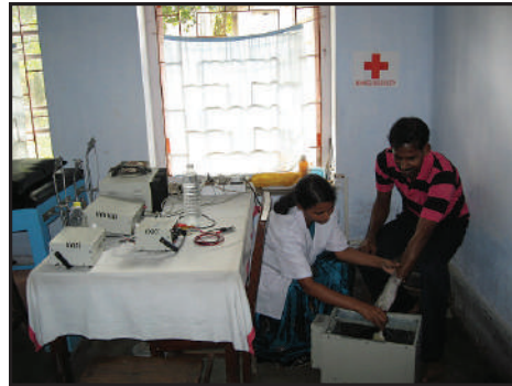
Treatment of physiotherapy with modern equipment