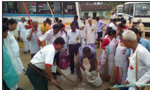
Cleaning drive by the Red Cross Branch