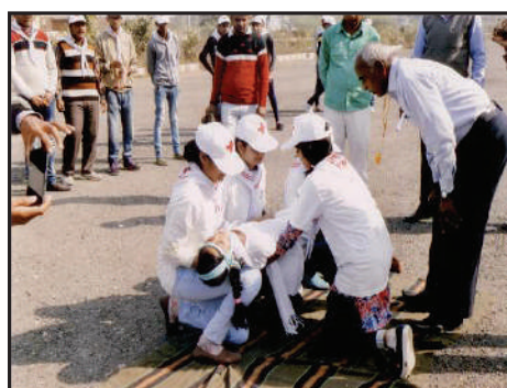
First Aid Training underway