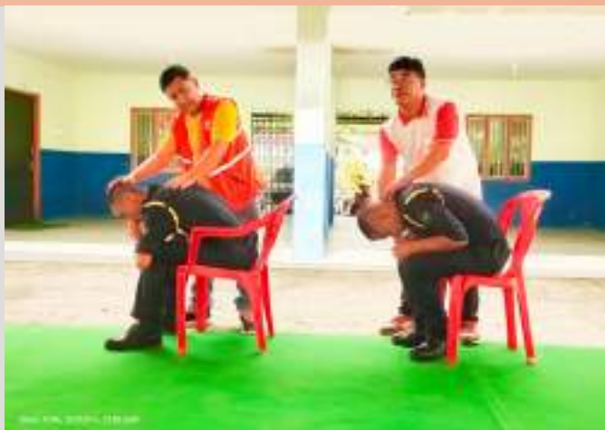
First Aid training, IRCS Imphal West District Branch, Manipur

THE DESIRE FOR THE WELL-BEING OF ONE'S OWN NATION CAN BE- AND MUST BE-MADE COMPATIBLE WITH THE WELFARE OF ALL HUMANITY.