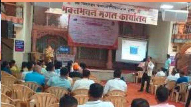
First aid training, Ozar, Maharashtra