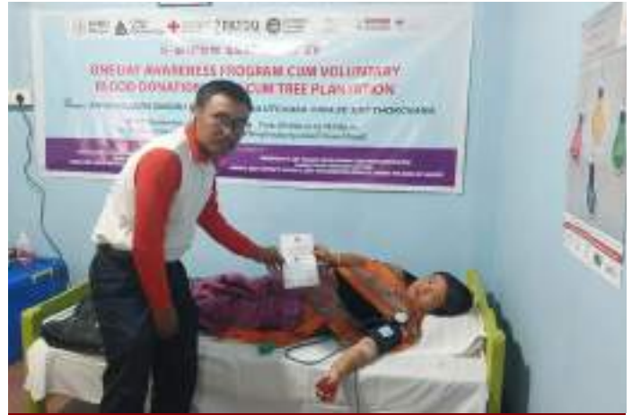
One day awareness program cum voluntary blood donation cum tree plantation, Khurai Ningthoubung Leikai, Imphal, Manipur,