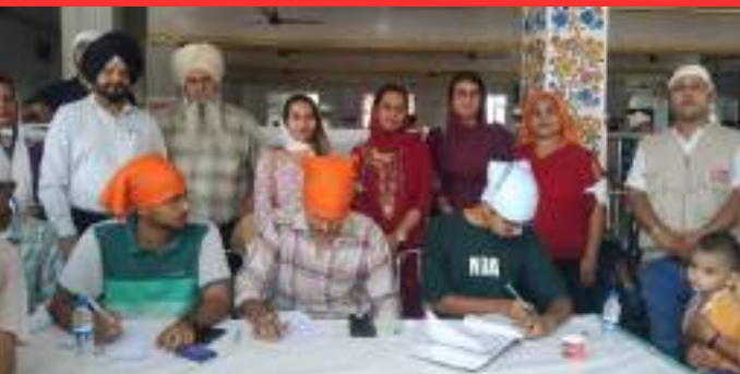
IRCS, Punjab State Branch, Chandigarh, held a Mega Health Checkup and TB Screening Camp at Gurudwara Sahib Chevin Patshahi, Lamba Pind, Jalandhar in collaboration with the IRCS, Jalandhar; District Health Society, Jalandhar; Gurudwara Sahib Chevin Patshahi, Lamba Pind, Jalandhar; and Humsafar Youth Club.