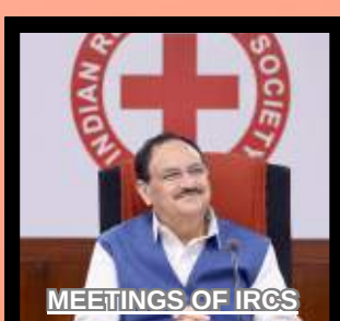
MEETINGS OF IRCS