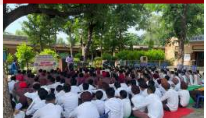
IRCS, Punjab State Drug De-Addiction & Rehabilitation Centre, Patiala, organized an anti-drug awareness session at Senior Secondary School, Yogipur