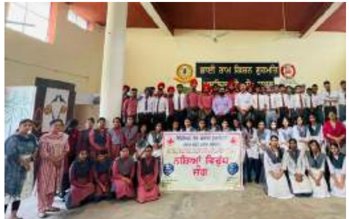
The Red Cross Drug De-Addiction and Rehabilitation Center, Patiala, organized an anti-drug awareness session at Bhai Ram Krishan Gumat Public Senior Secondary School.