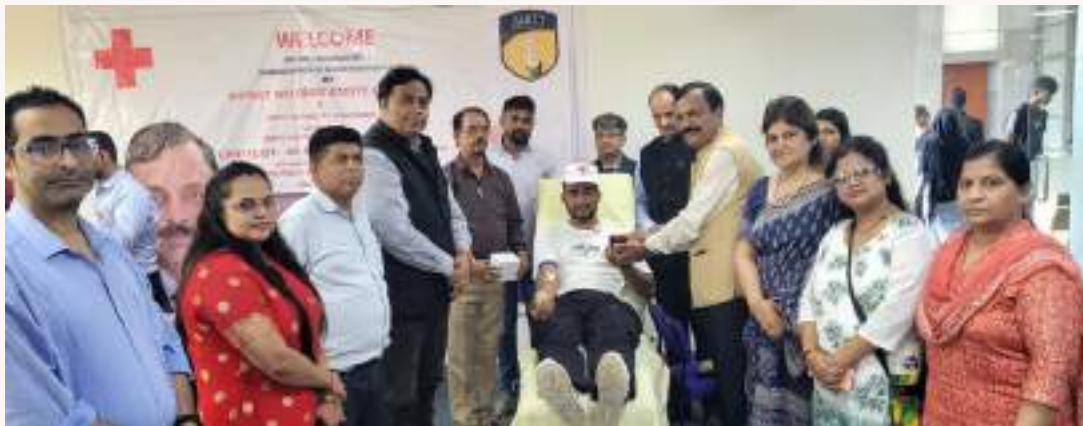
Mega Blood Donation camp at Amity University Gurugram, Haryana