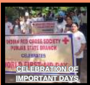
CELEBRATION OF IMPORTANT DAYS