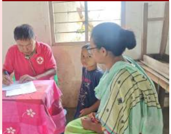
A basic psychological support program was conducted for the IDPs at Laphupat Tera Relief Camp, a very interior camp in Imphal West District. Treatment with medications were also done.