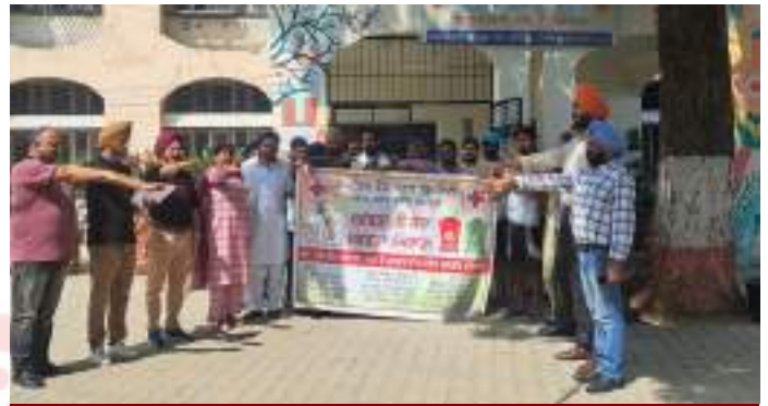
IRCS, Punjab State Drug De-Addiction & Rehabilitation Centre, Patiala, launched the Swachhata Hi Seva-2024 campaign under the guidance of the Ministry of Social Justice and Empowerment.