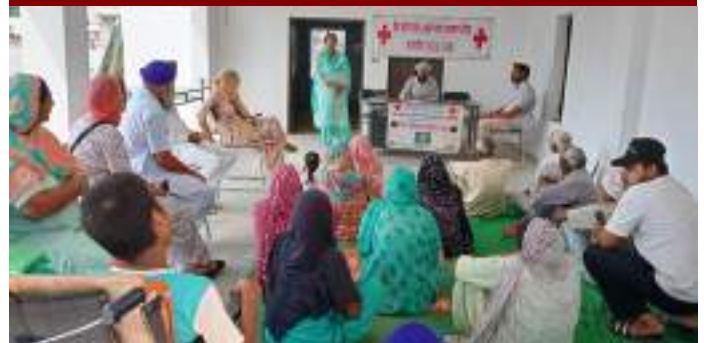
IRCS, Punjab State, Drug de-addiction and Rehabilitation Centre for Addicts, Nawanshahr, organized an awareness camp at village Rurki Kalan. The camp aimed to create awareness about the risks associated with drug abuse, its impact on individuals and families