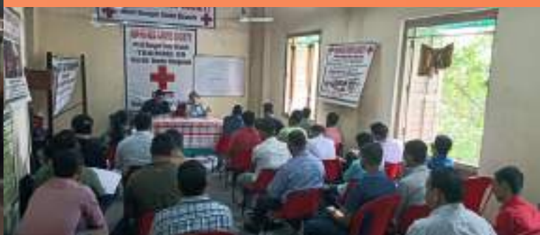
First aid training for Corporate concluded at IRCS SHQ Kolkata, West Bengal