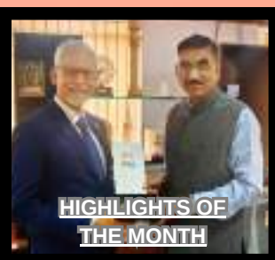
HIGHLIGHTS OF THE MONTH