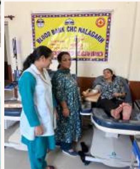
Red Cross Blood Centre Nalagarh, H.P organized two blood donation camps at Nalagarh & Ramshehar, district Solan