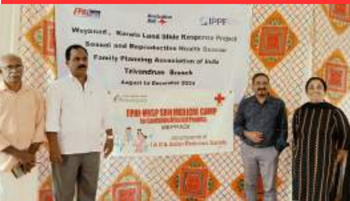
FPAI- MISP SRH Medical Camp for landslide affected people, joint program by IAG & Indian Red Cross, Kerala State Branch