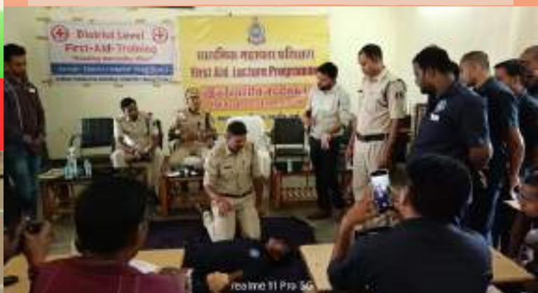
First aid training, Durg, Chhattisgarh