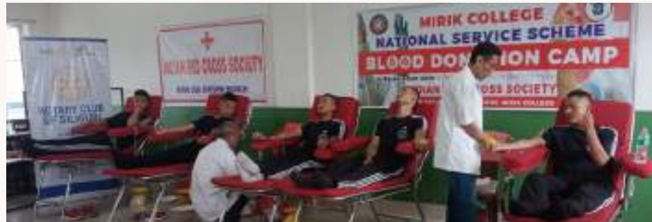
IRCS Mirik SD Branch, Darjeeling District organized a blood donation camp at Mirik College in collaboration with NSS Unit I & II of Mirik College.

THE GIFT OF BLOOD IS THE GIFT OF LIFE. SHARE THAT PRECIOUS GIFT TODAY