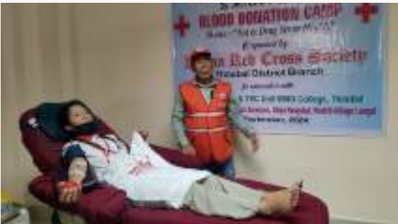
Blood donation camp was organised by IRCS, Thoubal District Branch in association with YRC unit WMG College, Thoubal