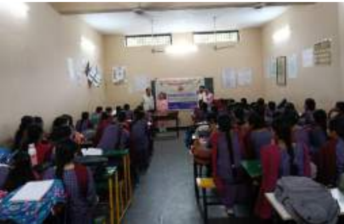
An awareness camp was held at Government Girls Sr Sec School, Gurdaspur under NMBA by IRCS Punjab State Drug De-addiction Centre.