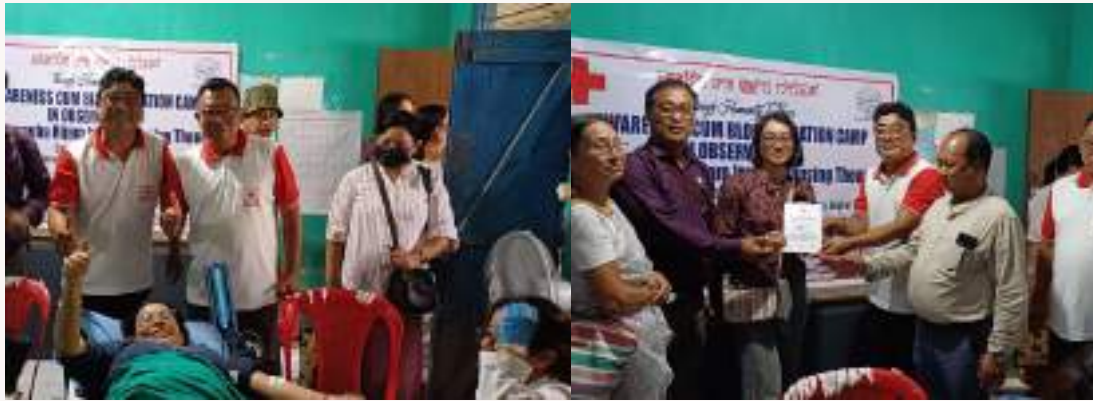
Awareness cum blood donation camp in observance of 128th Lamyamba Hijim Irabot Ningsing Thouram, Imphal West. 15 persons donated their blood.