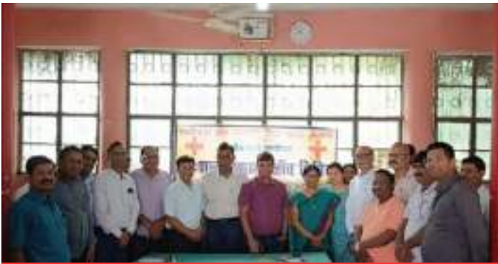
Health Camp was organised by IRCS, Nalanda district branch, Bihar