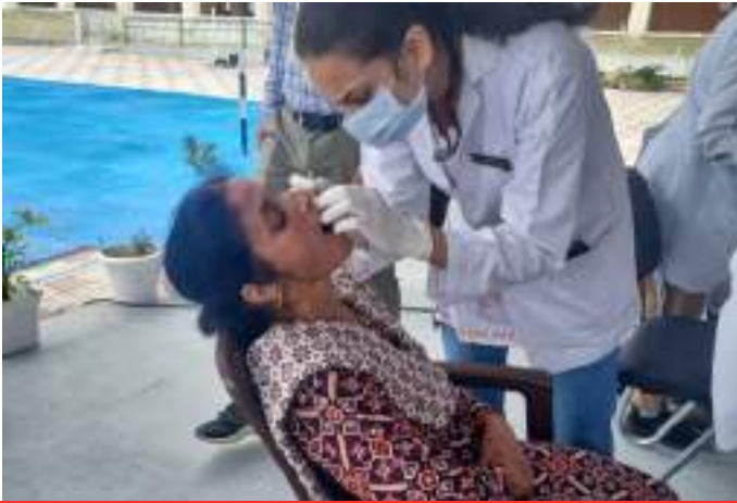
Free dental camp at Govt YRC Degree College Dhami Shimla by HP State Red Cross Branch