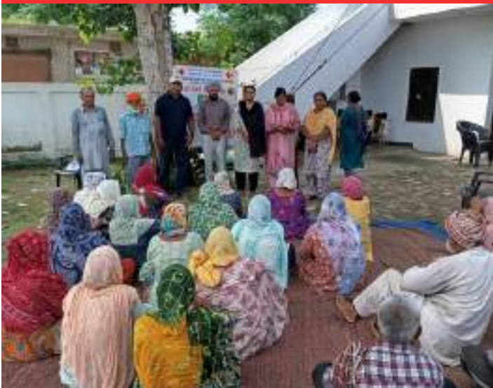
IRCS, Punjab State Branch, Chandigarh, and Nasha Mukta Bharat Abhiyan, in collaboration with the Red Cross Drug De-addiction Center Nawanshahr, organized an anti-drug awareness camp at Guruduwara Guru Ravidass Ji, Begampur.