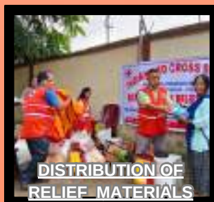
DISTRIBUTION OF RELIEF MATERIALS