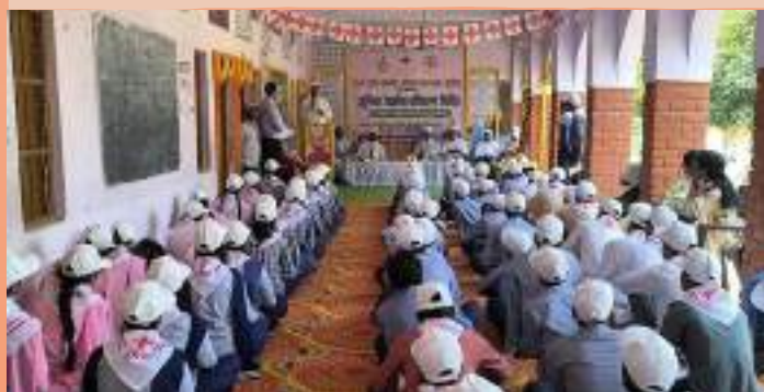
Junior Red Cross JRC five-day camps, Chandigarh, Haryana State Branch

THE EARTH IS THE CRADLE OF HUMANITY, BUT MANKIND CANNOT STAY IN THE CRADLE FOREVER.