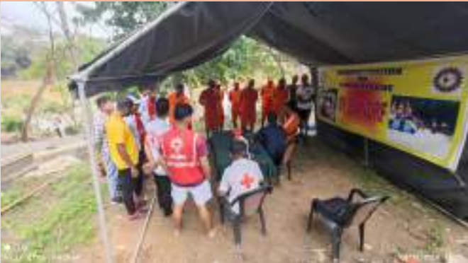
Volunteers of IRCS, Sonamura Sub-Divisional Branch, participated in drowning rescue Drill at Goumati River, Sonamura, Tripura