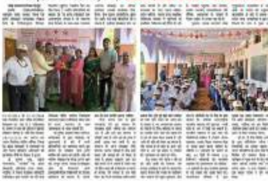
सोहबल के दुपहरा, सांख्य, जलजलक लहरा, काज अर्धर इत्यादि के बारे में जानकारी दें वही