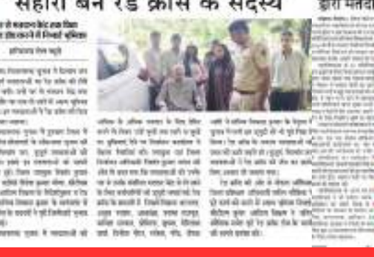
दिवांग जन व बुजुर्ग मतदाताओं का सहरा बने रेड क्रॉस के सदस्य