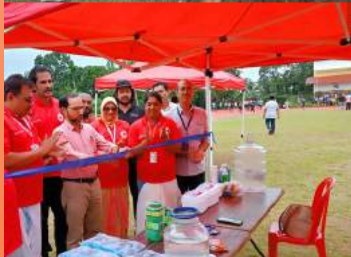
First Aid Centres at Sub Districts of IRCS Vatakara, Kuttiyadi and Kozhikode, Kerala