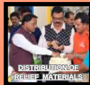
DISTRIBUTION OF RELIEF MATERIALS