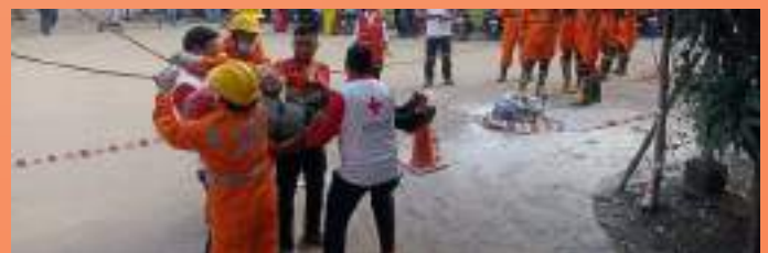
Mock Drill was held at Imphal West DC complex in collaboration with NDRF, DC office staff, Manipur Fire Service, Imphal West Police, CMO Imphal West and IRCS Imphal West District Branch.