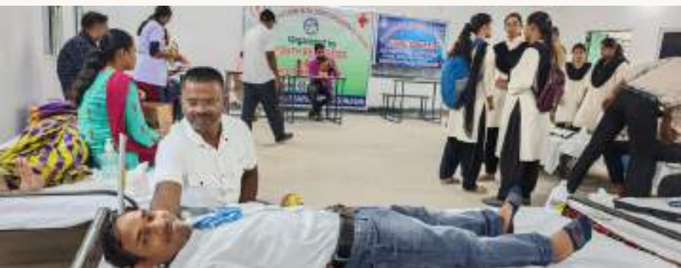
YRC & NCC volunteers during blood donation camp at D D University, Keonjhar, Odisha