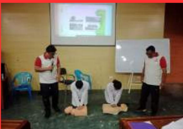
First aid program was conducted for foundation course 2024-25 for 1st year MBBS students, Imphal West District Branch.