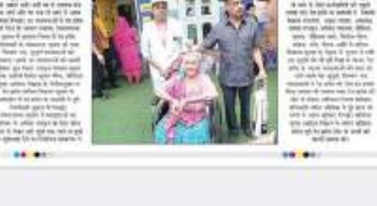
महिलाओं को रेड क्रॉस की दिल से जताया आभार