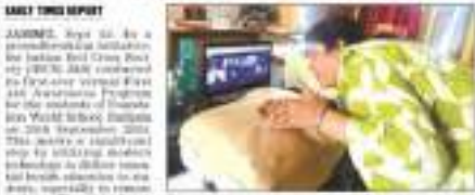
Indian Red Cross Society organizes virtual first aid awareness session