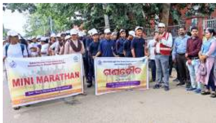
International Day for Disaster Risk Reduction was observed at Boudh, Odisha