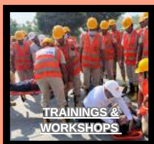
TRAININGS & WORKSHOPS