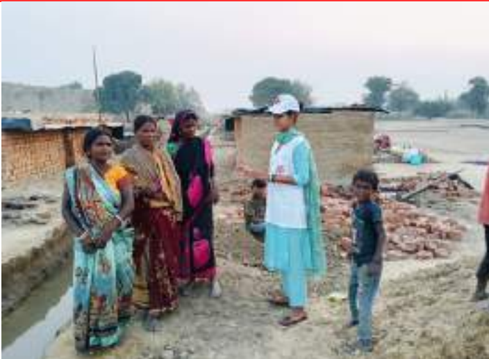
TB eradication awareness session, Red Cross, Rohtak, Haryana