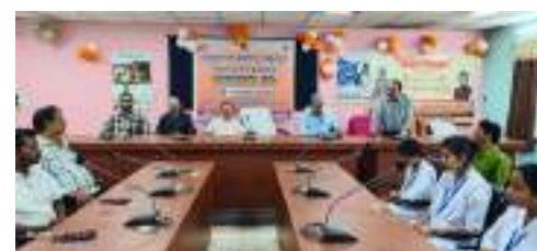
District Level National Voluntary Blood Donation Day celebration Keonjhar, Odisha