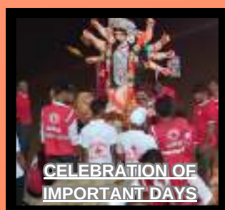
CELEBRATION OF IMPORTANT DAYS