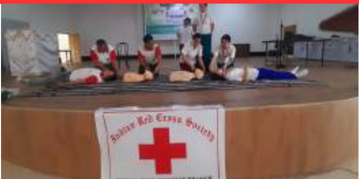
One Day Awareness program for Blood Donation and Basic First Aid conducted for General Nursing and Midwifery (GNM) and Bachelor of Science in Nursing (BSc nursing) Students at RDO Nursing Institute Lamsang, Imphal West District Branch, Manipur.