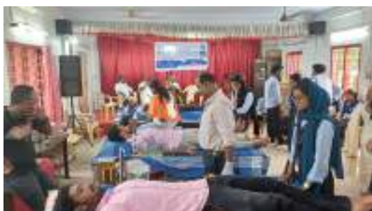
Blood donation camp, kollam, kerala