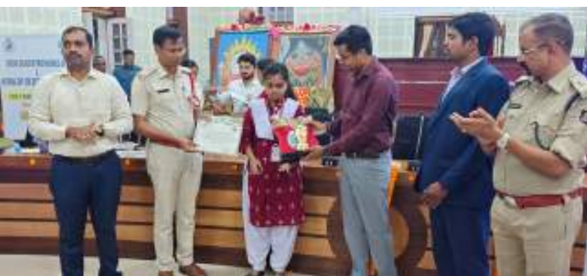
International Day for Disaster Risk Reduction was observed at Keonjhar, Odisha