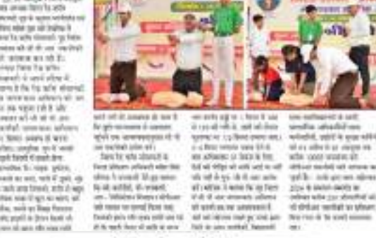
इस वीडियो सत्र में हमने सीपीआर की जानकारी सभी के लिए लाभकारी