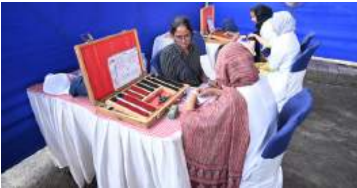
Eye Checkup camp, IRCS, Malappuram district branch, Kerala