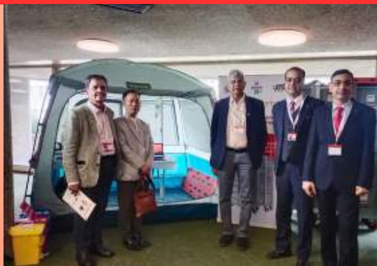
Demonstration of Bharat Health Initiative for Sahyog Hita & Maitri (BHISHM) Cube. State of the art made in India portable units are aimed at rapid deployment of medical facilities in emergency situations. Indian delegation of IRCS visited the stall of BHISM CUBE.