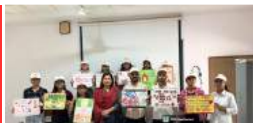
Awareness Rallies were organised and Blood Donation Pledge were taken by the volunteers on the occasion of National Voluntary Blood Donation at Sanatan Dharma College, Ambala CanTT.