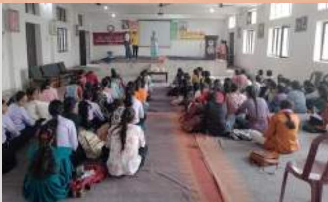
First Aid Training and awareness campaign about drug-de-addiction organised by District Red Cross Branch, Kurukshetra Branch, Haryana at Government Women College Kurukshetra.