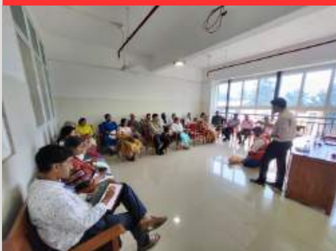
First Aid Training, IRCS Kerala State Branch