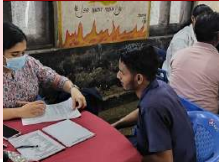
On account of Goa State Road Safety Week, IRCS Salcete Branch along with Sarthak Foundation and South Goa Directorate of Transport organised a medical and eye check up camp for the staff of Kadamba Transport Corp. Margao Depot.