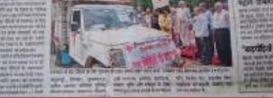
वाह पौड़ों की मदद सराहनीय कदम : राज्यपाल