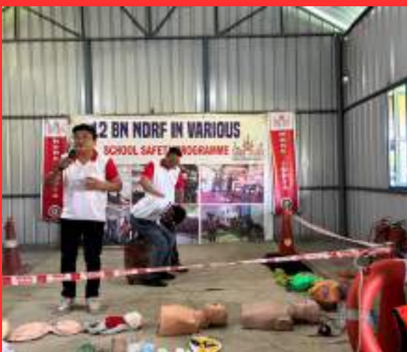
IRCS Imphal West District and 12 BN NDRF Conducted one day school safety program at AJAD english school

THE EARTH IS THE CRADLE OF HUMANITY, BUT MANKIND CANNOT STAY IN THE CRADLE FOREVER.