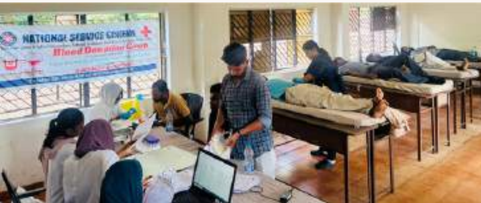
IRCS, Kozhikode in association with NSS unit of Thiruvangoor HSS and Iqra Hospital organised a blood donation camp at Thiruvangoor HSS.

EMPATHY IN ACTION: WHERE EVERY DONATION BECOMES A LIFELINE.