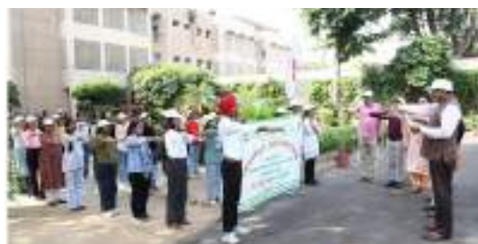
University Youth Red Cross of Guru Jambheshwar University, Hissar celebrated National Voluntary Blood Donation Day