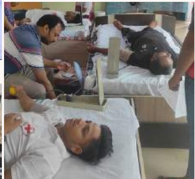
IRCS, Sonamura Sub-Divisional Branch organized a blood Donation camp at sonamura & sepahijala districts of Tripura.