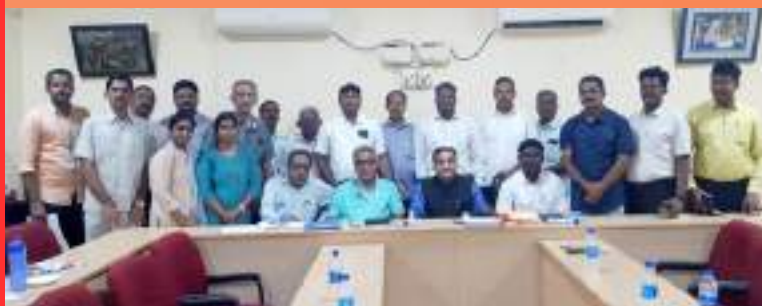
Assessment of First Aid Lay Lectures of IRCS Tamilnadu state Branch and st John Ambulance Tamilnadu was conducted at Chennai.