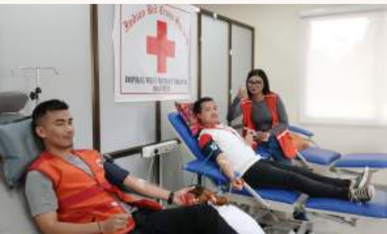
Blood donation camp, Imphal West District Branch, Manipur