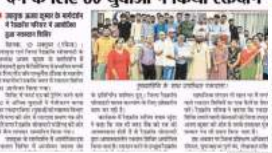
दौलेतीमिया से राहत बच्चों को नया जीवन देने के लिए 50 युवाओं ने किया रक्तदान