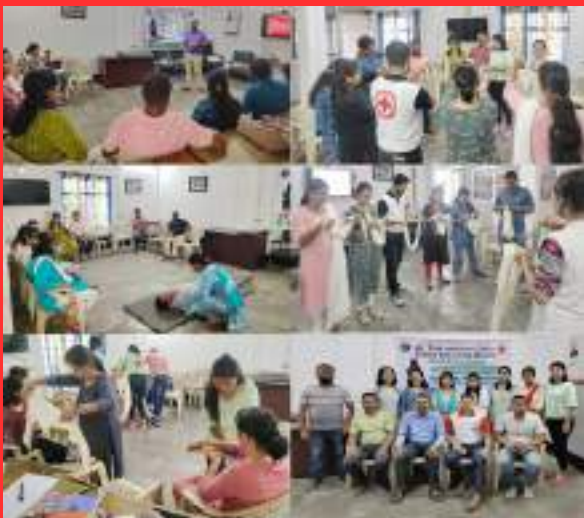
First aid training, Guwahati, IRCS, Assam State Branch