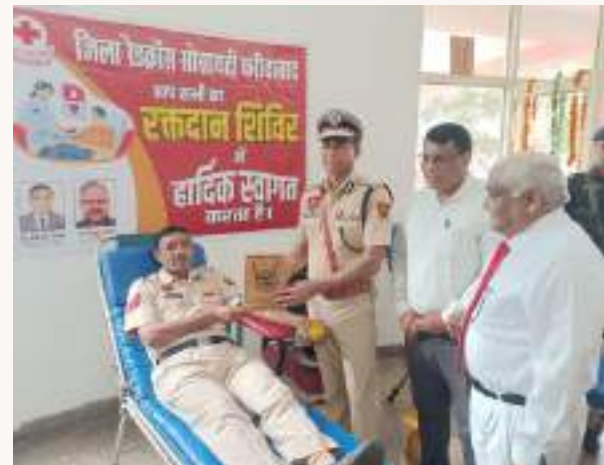
Blood donation camp, Faridabad, Haryana.