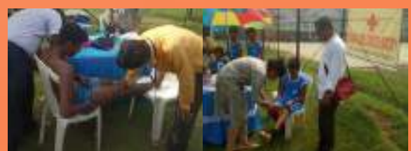
First aid post at 68th State School Games 2024 was organised by IRCS, Purba Bardhaman, District Branch, West Bengal