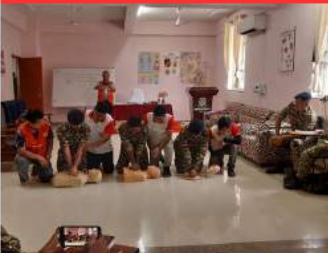
IRCS Imphal West District Branch conducted first aid training program for CRPF jawans of Nagaland & Manipur at Group Centre Manipur and Nagaland Sector CRPF Langjing, Imphal