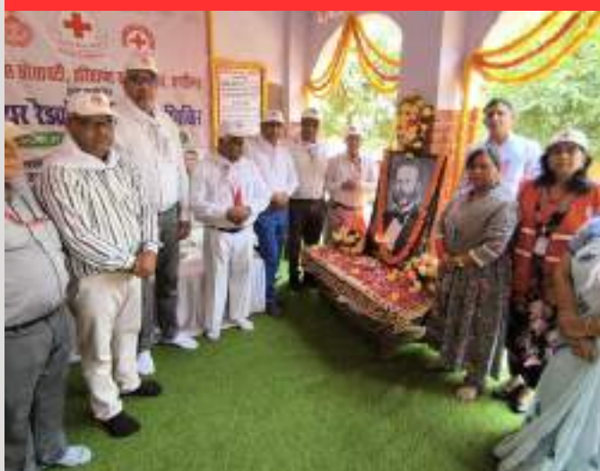
Inauguration of JRC five days junior Red Cross Camp by district education officer of Faridabad district, Haryana.

THE DESIRE FOR THE WELL-BEING OF ONE'S OWN NATION CAN BE- AND MUST BE-MADE COMPATIBLE WITH THE WELFARE OF ALL HUMANITY.