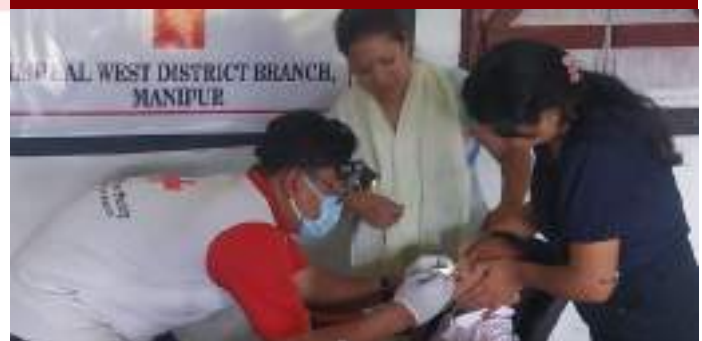
Dental camp was held at HD Foundation, Lamdeng, Manipur,