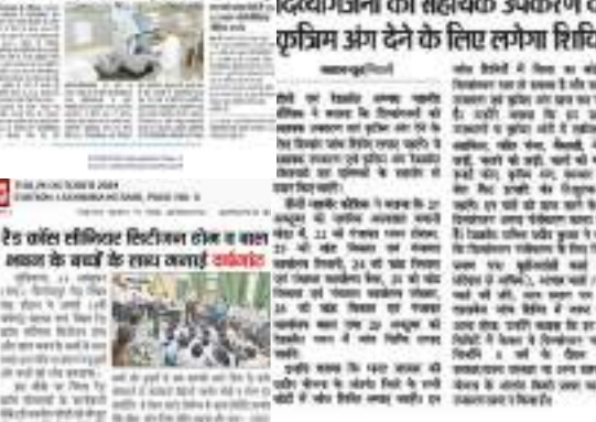
दिवांग जनों को सहायक उपकरण व फुजिम अंग देने के लिए लगभग सितार