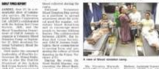
JK DFCL, IRCS celebrate National Voluntary Blood Donation Day