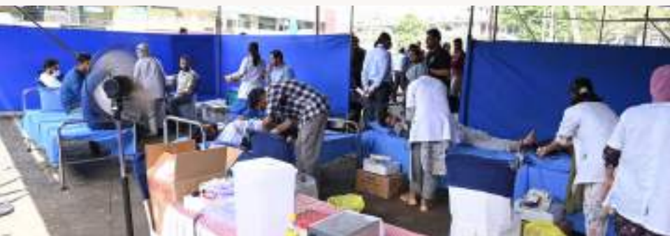
Blood donation camp, IRCS, Malappuram district camp, Kerala