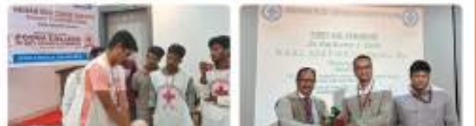
First aid training, Poona College campus, Pune District Branch, Maharashtra