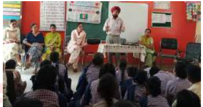
Under the "Nasha Mukat Bharat Abhiyan," the Red Cross Drug De-addiction Centre, Nawanshahr, held a drug awareness camp at Government High Smart School, Sarhala Ranuan.