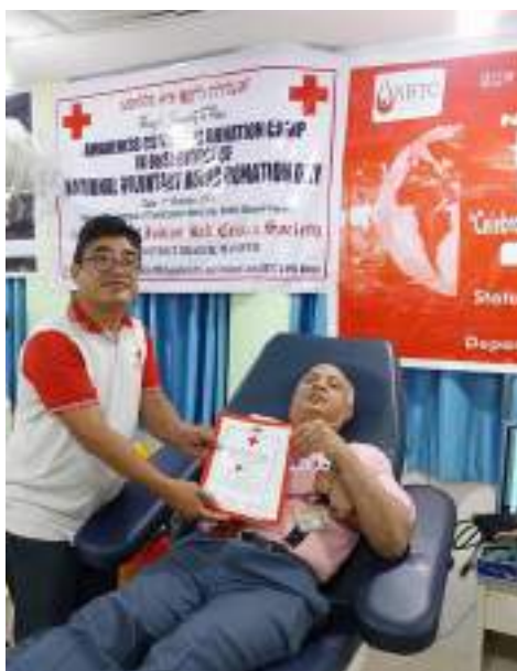
IRCS, Imphal East & Imphal West District Branches of Manipur organised Voluntary Blood Donation programmes in different centres