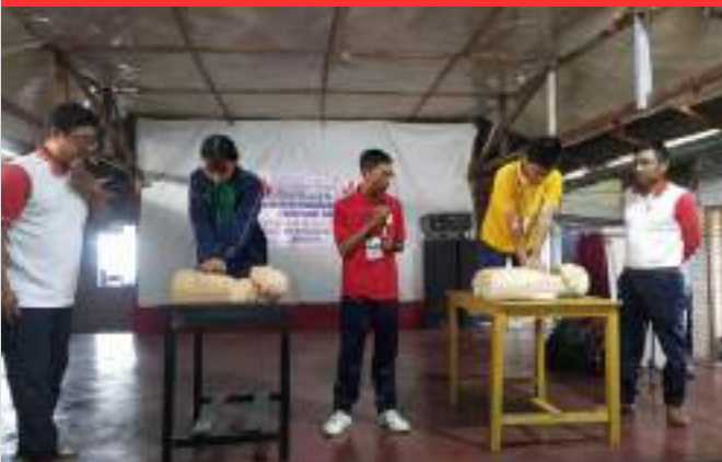
IRCS Imphal West District and 12 BN NDRF conducted one day school safety program at Vale Academy