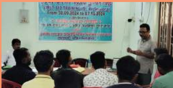
First aid training, IRCS Dakshin Dinajpur District Branch, Balurghat, West Bengal