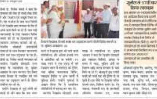
महात्मा गांधी सेवा ही सचची सेवा, रेडक्रॉस इन्फेक्टियस रोगों के रोगी