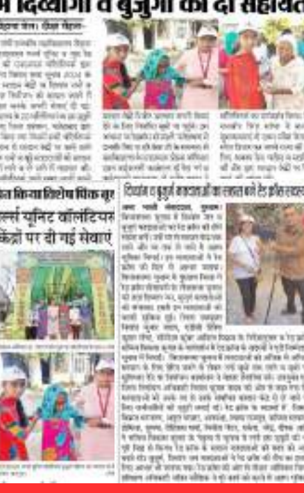
दिवांग जन व बुजुर्ग मतदाताओं का सहरा बने रेड क्रॉस के सदस्य