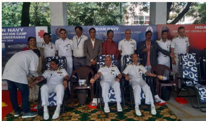
The CEO of the IRCS Telangana State Branch and the Director of the Defence Machinery Development Establishment (DMDE) inaugurated a blood donation camp in Bowinpalli, Hyderabad.