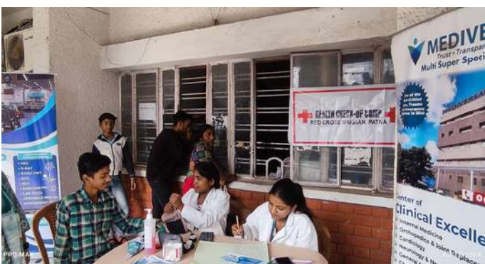
Health Check up camp at Red Cross Bhawan, Patna, Bihar