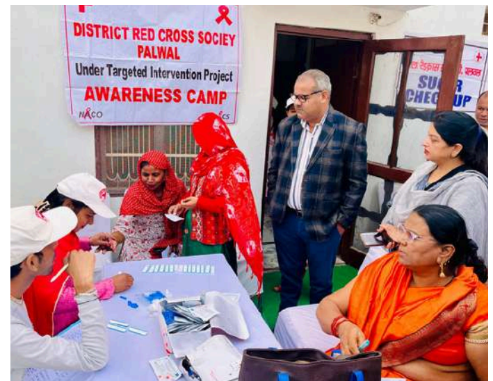
District Red Cross Branch, Palwal, Haryana organised various activities i.e. Voluntary Blood Donation Camp, TB Awareness Programme, Drug-de-addiction workshop.