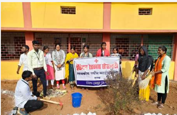
Cleanliness drive was conducted in Government College Sanna District Jashpur by the Red Cross students along with Eco Club