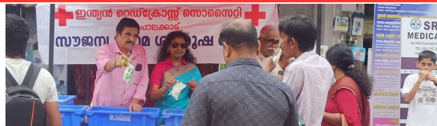
IRCS Palakad district branch distributed buttermilk to the pilgrims of the great car festival of Kalpathy Palakkad.