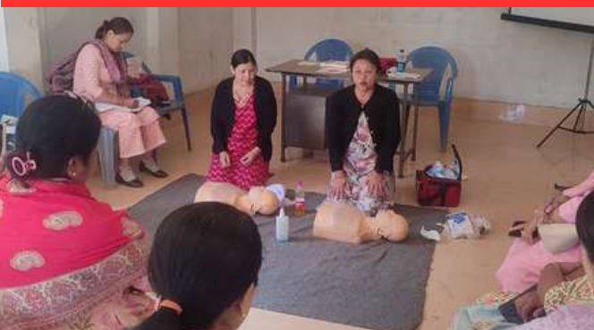
First Aid training of the ANM/GNMs of Imphal East was conducted at IRCS, Manipur state branch