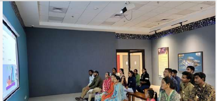
Online physiotherapy seminar was held by IRCS Gujarat.