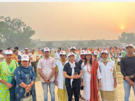
Run For Unity, Red Cross Palwal, Haryana

Volunteers from the IRCS Sonamura Sub-Divisional Branch served as a support/rescue team in Rudra Sagar/Neermahal during the National Director TRLM visit.