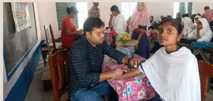
Two Thalassemia Detection Camps were held at Kamari, Nadia, West Bengal ; at Kamari High School (H.S.) & Kaliganj Rural Hospital, Kaliganj. These camps were organized by IRCS Kaliganj Branch & carried out by the Sadar Hospital's Thalassemia Control Unit in Krishnanagar, Nadia.