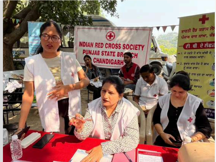
IRCS, Punjab State Branch participated in the event TARANG organised by Punjab University, Chandigarh. More than 450 people benefited from the event.