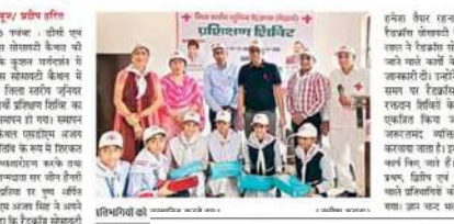
प्रार्थी प्रशिक्षण शिविर में भाग ले रहे छात्र।