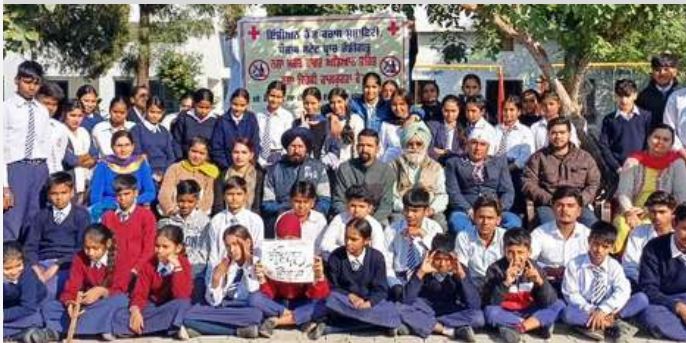
IRCS, Punjab State Branch, had the privilege of hosting a Karate team from Nepal at its Integrated Rehabilitation Centre for Addicts in Nawanshahr, Punjab