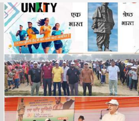
Run For Unity, Red Cross Bhiwani, Haryana