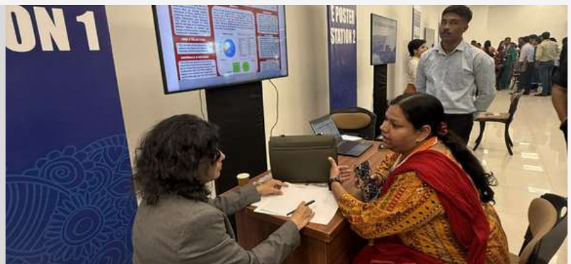
Staff of Ahmedabad Red Cross attended National Conference held at Gandhinagar, Transcon 2024.

"WE MAKE A LIVING BY WHAT WE GET, BUT WE MAKE A LIFE BY WHAT WE GIVE." - WINSTON CHURCHILL