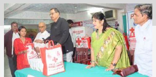
Distribution of nutritious kits to TB patients, Jamshedpur, Jharkhand