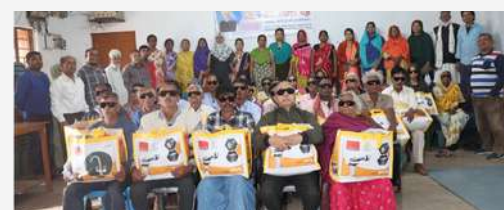
Eye check up camp, Jamshedpur, Jharkhand