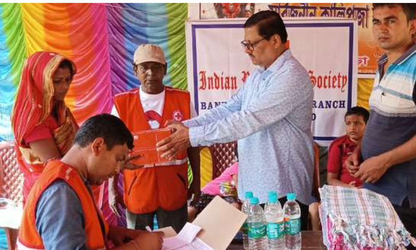
IRCS, Bankura District Branch, West Bengal distributed hygiene kits, kitchen sets, buckets, bed sheets, tarpaulins & towels to the needy & vulnerable people at Kadra Village.

LOVE AND COMPASSION ARE NECESSITIES, NOT LUXURIES. WITHOUT THEM HUMANITY CANNOT SURVIVE.