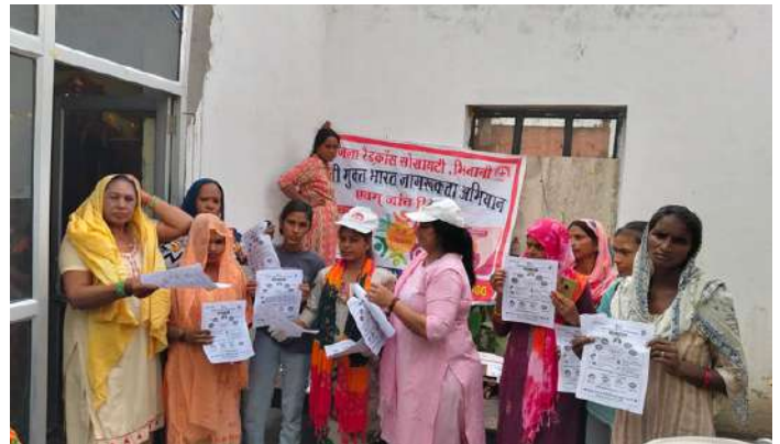
TB awareness programme, Bhiwani, Haryana