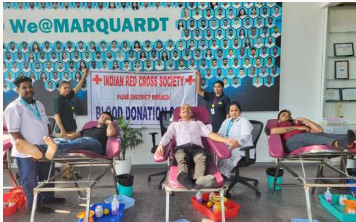
IRCS Pune organized blood donation camp at Hinjewadi

EMPATHY IN ACTION: WHERE EVERY DONATION BECOMES A LIFELINE.