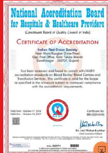
IRCS Gandhinagar, district branch blood centre and transfusion services has received the accreditation certificate from NABH.