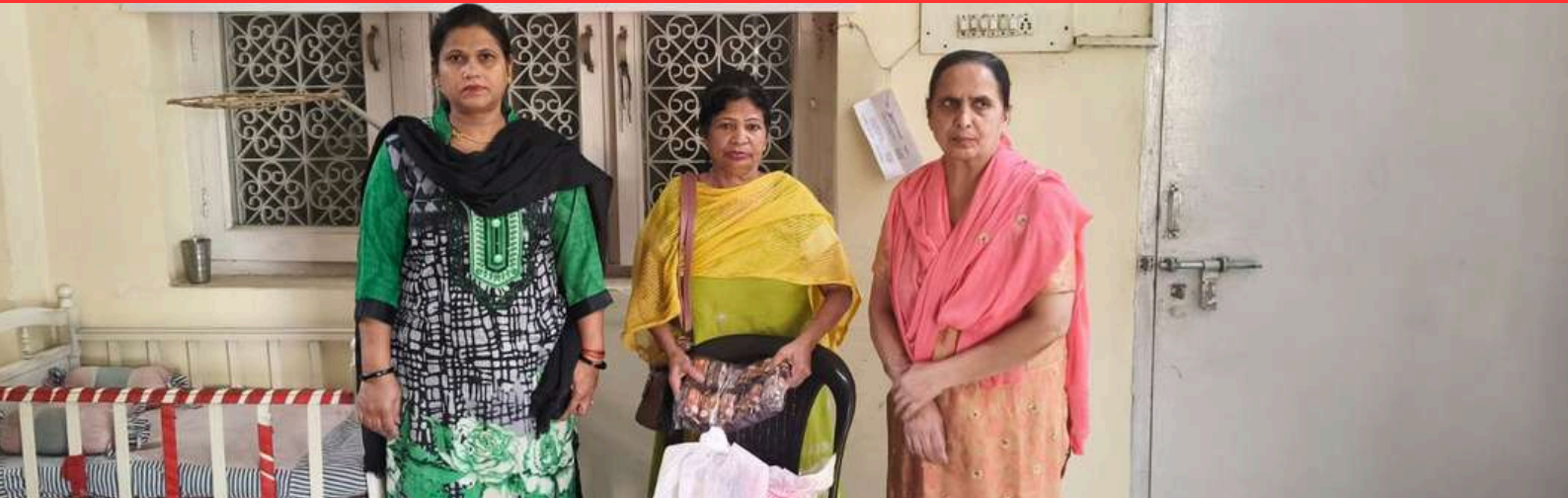
The Indian Red Cross Society, Punjab State, District Branch Amritsar, distributed ration kits to needy families in the city, continuing its humanitarian efforts.