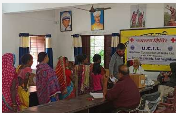
Eye check up camp in collaboration with UCIL was held at Badiya Panchayat, Jamshedpur, Jharkhand