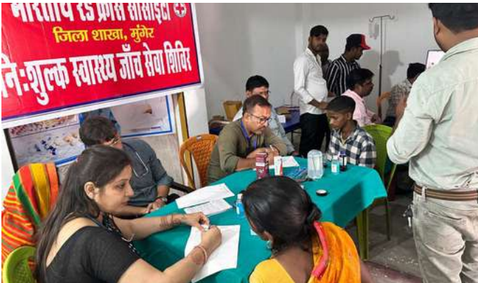
Free health check up camp, Munger, Bihar