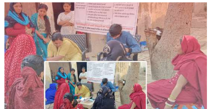
HIV/AIDS awareness and testing camp organised by TI run by District Red Cross Society Palwal in kailash nagar.