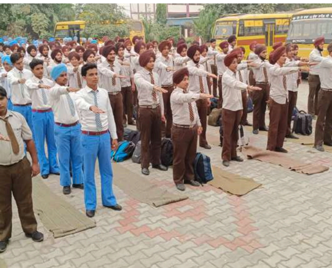
IRCS Punjab State Branch Chandigarh organised an awareness camp at Golden view Public Sr. sec. school, village Tarpalla block Dera Baba Nanak.