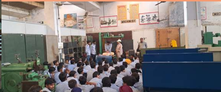
District Red Cross Branch, Ambala, Haryana organised First Aid Training for Industrial Workers on 10th November 2024.

Indian Red Cross Society, Haryana State Branch organised various events and programmes like health awareness programme, TB Awareness campaign, Voluntary Blood Donation Camp, Membership Drive etc. through its District Red Cross Branches (Ambala, Jind, Bhiwani, Fatehabad, Gurugram, Kaithal, Karnal, Palwal, Panchkula & Rohtak) from 6th to 12th November, 2024.