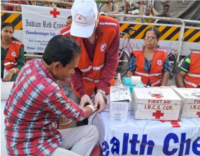
IRCS Chandannagar S.D. Branch, Hooghly District, is conducting a first aid post during the immersion of Jagadhatri Idol.