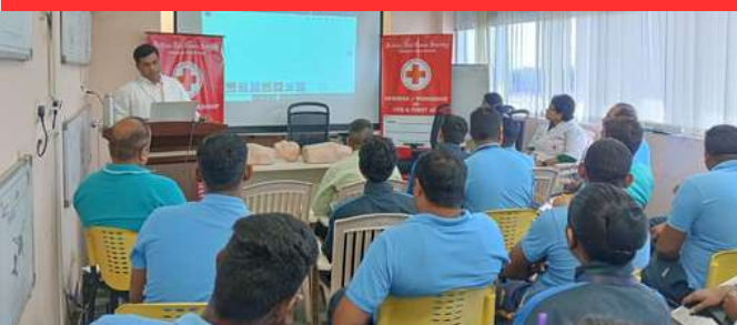
A three day First Aid Training program was held at Rajeev Gandhi International Airport, Hyderabad