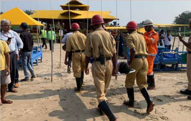
YRC Volunteers participated in the National Tsunami Mock exercise at Turtle Beach Morjim, Goa