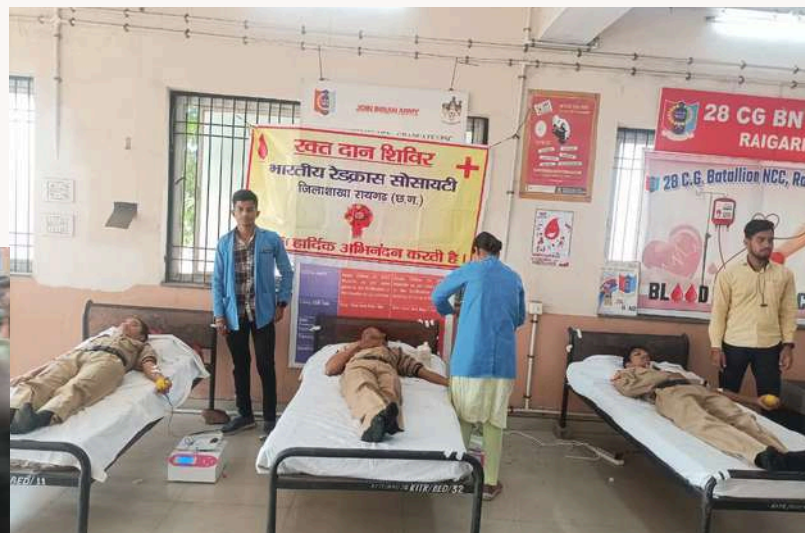
Blood donation camp, Raigarh, Chhattisgarh