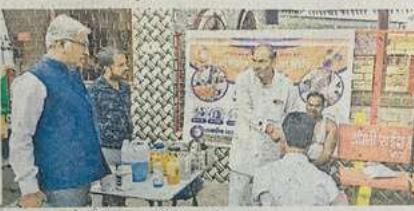
शिविर के दौरान मरीजों को परामर्श देते हुए।

नईदुनिया प्रतिनिधि, ग्वालियर सम्पूर्ण फाउंडेशन ट्रस्ट ने राष्ट्रीय सेवा भारती और भारतीय रेडक्रॉस सोसायटी मग के सहयोग से मानव सेवा कुष्ठ आश्रम बहोदपुर में कुष्ठ रोग से प्रभावित लोगों और उनके परिवारों के लिए निःशुल्क चिकित्सा शिविर का आयोजन किया। शिविर में आधुनिक तकनीक और प्रशिक्षित पैरामेडिकल द्वारा रक्तचाप, रैडम ब्लड शुगर और 19 पैरामीटर की ब्लड टेस्टिंग की गई। कुष्ठ रोग के कारण अक्सर से जुड़े रोगियों को विशेष उपचार दिया गया, जिसमें सफाई, इंजेक्शन और कुछ छोटे आपरेशन शामिल थे। मरीजों को दवाइयां, महिलाओं को सेनेटी पेड और अक्षय व्यक्तियों को सहायक उपकरण वितरित किए गए।