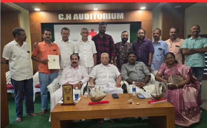
First aid training, Vatakara Sub district branch, Kerala