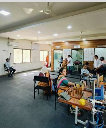
Physiotherapy session was held by Gujarat Sate branch