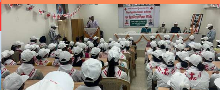
District Red Cross Branch, Fatehabad, Haryana organised District Level Youth Red Cross Training Camp from 7th to 11th November, 2024 at Manohar Memorial College, Fatehabad.