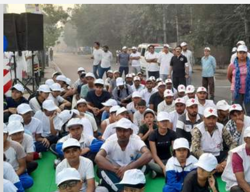
Run For Unity, Red Cross Rohtak Haryana