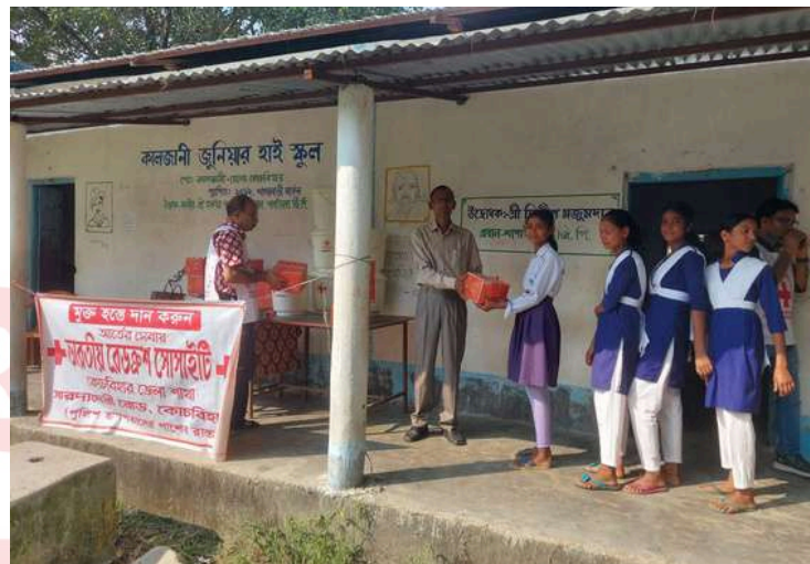
The IRCS Cooch Behar District branch, West Bengal distributed hygiene kits, plastic buckets, and other supplies to underprivileged and needy students at a junior high school in Kaljani, Cooch Behar District.