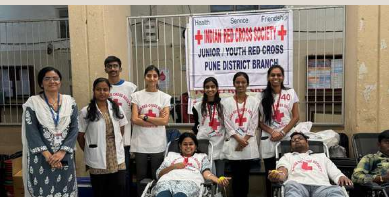
Blood donation camp, Pune, Maharashtra