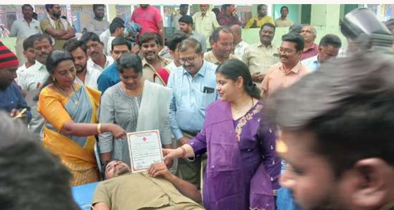
Blood donation camp, Hanumakonda, Telangana