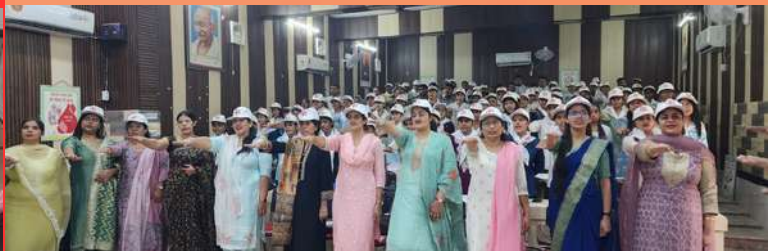
District Red Cross Branch, Bhiwani, Haryana organised District Level Youth Red Cross Training Camp from 5th to 9th November, 2024 at Pt. Sita Ram Shastri College, Bhiwani.