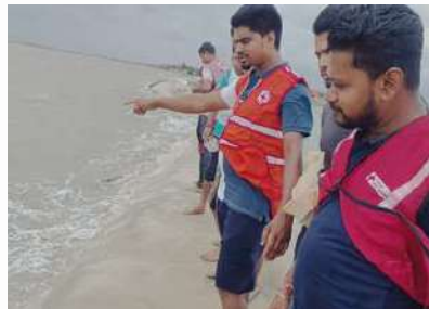
River and dams were monitored by the volunteers of IRCS North 24 Parganas district branch. Rescue operation were carried out and relief items were provided to the vulnerable.