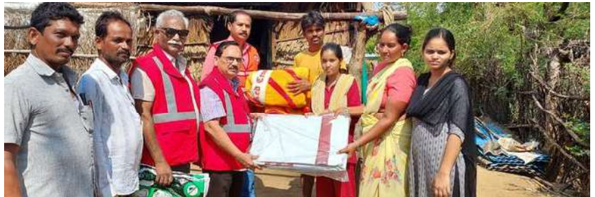
Distribution of tarpaulins, blankets and mosquito nets amongst needy and poor of Garla Mandal, Mahabubabad, Telangana