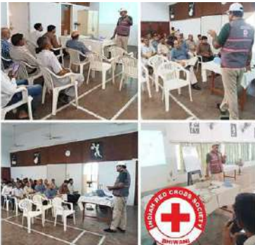
Professional First Aid Training at Hindustan Gum & Chemicals Limited, Bhiwani, Haryana