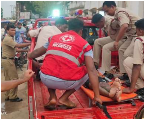
Mock drill exercise & awareness program on disaster management was held by IRCS, Sonamura Sub Divisional Branch, Tripura in collaboration with NDRF, fire service, TSR & other line departments on 18th May, 2024.