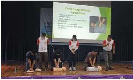
Programs in basic life support and CPR awareness were offered to medical postgraduate (MD/MS) students by IRCS Imphal West District, Manipur.