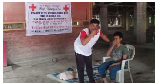
Volunteers of IRCS, Imphal West district branch conducted Awareness Programme for basic first aid to the workers of brick laying field at Lamsang.