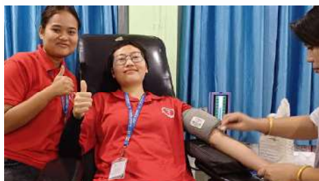
IRCS Manipur Branch together with CMC College of Nursing conducted a voluntary blood donation camp at RIMS.

IRCS Davengere district branch, Karnataka organised series of blood donation camps at several cities through the blood mobile buses donated by IRCS NHQ.