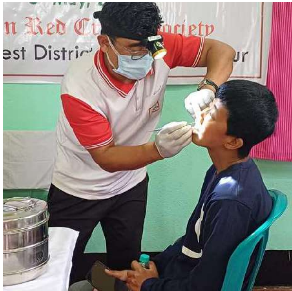
Dental Camp was conducted by IRCS Imphal West district branch, Manipur on the occasion of World Red Cross Day