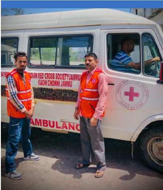
IRCS J&K branch provided essential relief to the victims of land sinking incident in Ramban.