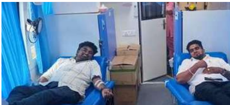
Blood donation camp, Kundrathur bus stand, Chennai,