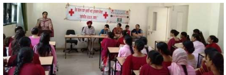
Red Cross Drug De-Addiction and Rehabilitation Center Nawanshahr, Punjab organized a drug awareness camp under "Nasha Mukat Bharat Abhiyan" at Government Industrial Training Institute, Nawanshahr (Punjab)