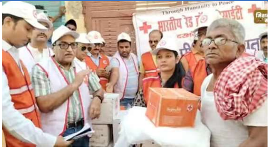
Distribution of relief items amongst the fire victims in Ratanpura village of Darbhanga district of Bihar