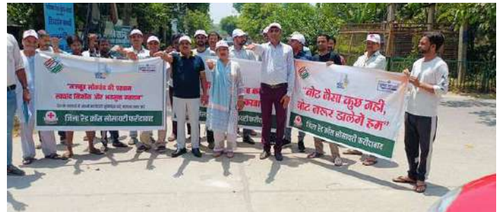
Employees of various projects located in Red Cross De-addiction Complex, Sector 14 Faridabad, Haryana were appealed to vote and everyone was made to take the voter oath.