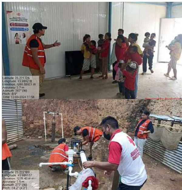
IRCS Senapati Branch youth volunteers held an awareness campaign about child safety and child feeding at several relief centers in Kangpokpi District. They also undertook social work on solid waste and drainage in relief centers in Kangpokpi.