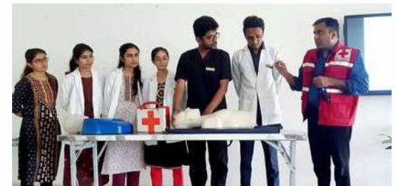
Training program on life saving BLS and CPR for post Graduate students and interns of Ambedkar Dental College and Hospital, Bangalore