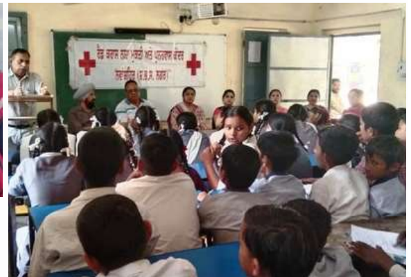
Red Cross Drug De-addiction and Rehabilitation Center Nawanshahr, Punjab organized an awareness camp under "Nasha Mukat Bharat Abhiyan" at Government High School, Bhin (Nawanshahr).