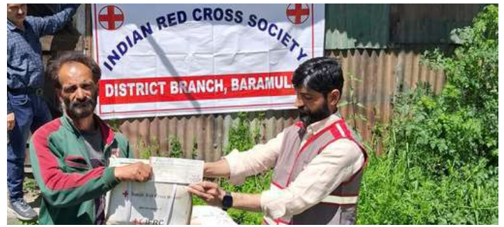
Rs 40000/- through cheques along with 4 kitchen sets, blankets, tarpaulins, buckets etc. were provided by the Chairman of District Red Cross, Baramulla to 04 fire victims of village Thajal Uri.