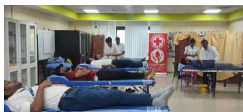
Blood donation camp at Valeo India, Chennai