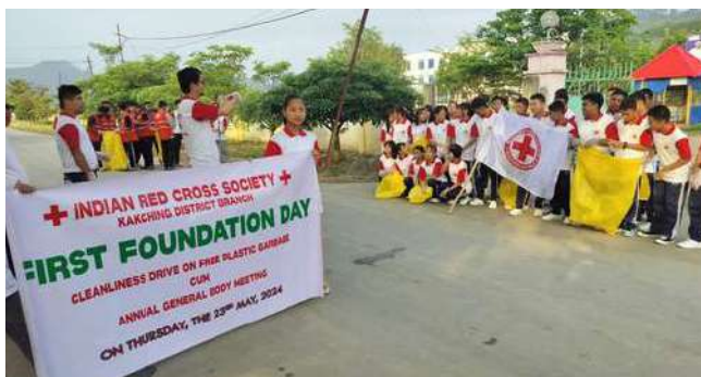
A plastic free campaign was organised on the first foundation day of IRCS, Kakching district branch, Manipur.