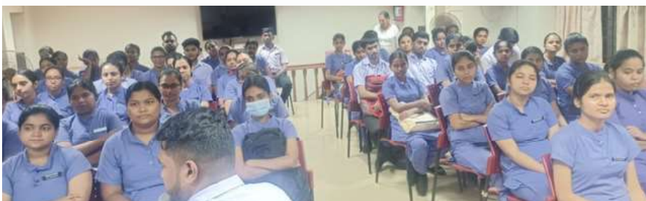
Students of the Institute of nursing education, Bambolim visited IRCS state branch at Panaji, Goa