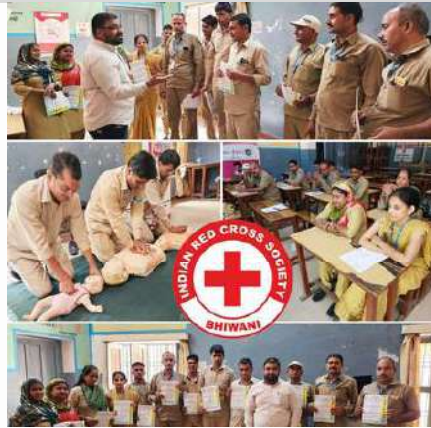
First aid training to drivers and conductors in Bhiwani district, Haryana.