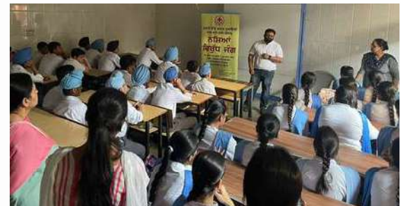
An awareness lecture was organized by Red Cross Drug De-addiction Centre, Patiala, Punjab at Shri Harkrishan Public School Patiala. 100 people benefited from this session.