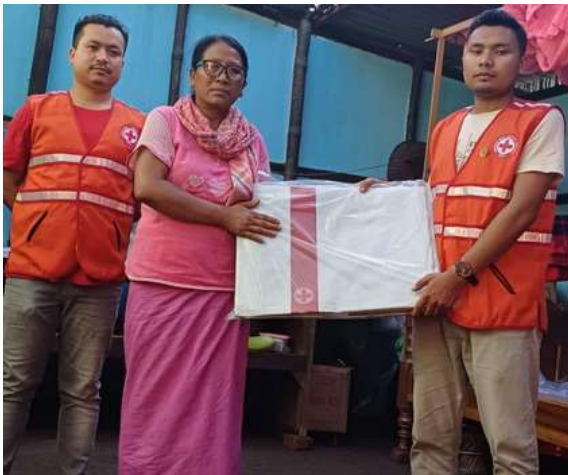
Families affected by hailstorms received tarpaulins by the volunteers of Imphal West District Branch.