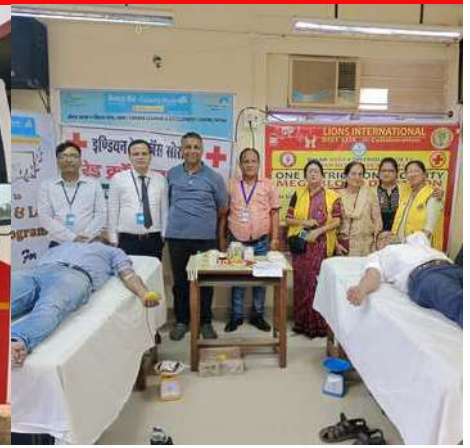
IRCS Bihar state branch organised voluntary blood donation camp in collaboration with Lions club, Patna, Bihar