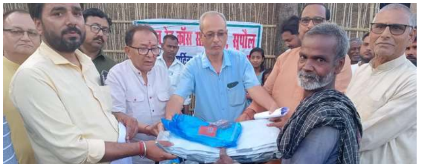
Distribution of tarpaulins and mosquito nets amongst needy and poor, Supaul, Bihar