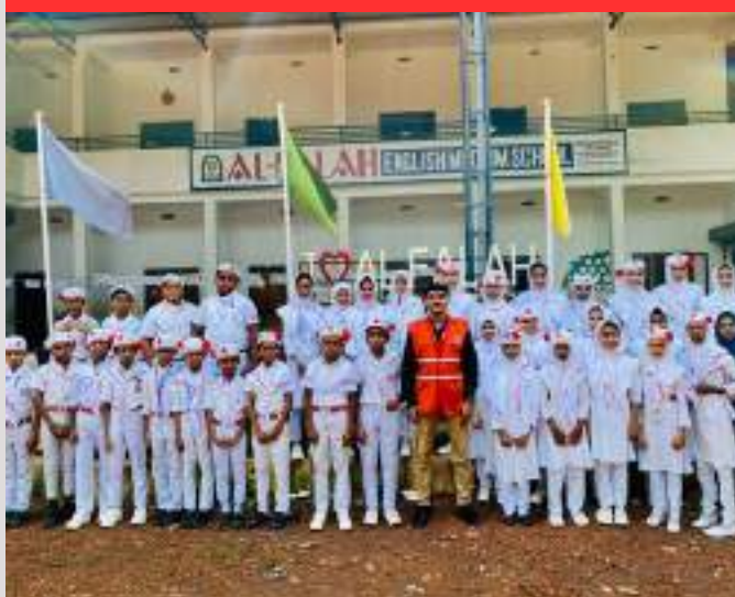
JRC First aid training, Peruvallur, Kerala

EVERY DAY SEES HUMANITY MORE VICTORIOUS IN THE STRUGGLE WITH SPACE AND TIME.