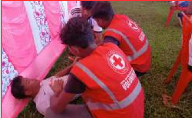
Volunteers of IRCS, Sonamura Sub-Divisional Branch gave first aid to players at State Football tournament of Tripura