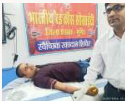
Blood donation camp, Munger, Bihar

IRCS NHQ BLOOD CENTER TIMINGS FOR BLOOD DONATION: MONDAY- SATURDAY (EXCEPT 2ND SATURDAY): 9 AM - 7 PM 2ND SATURDAY, SUNDAY, PUBLIC HOLIDAYS: 10 AM - 6 PM NOTE: THE NHQ BLOOD CENTER IS OPEN 24/7 FOR ISSUE OF BLOOD