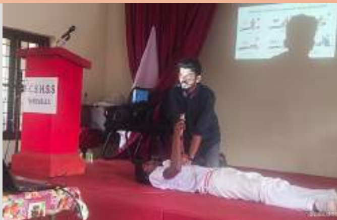
Pathanamthitta district counsellors meet and first aid training, Kerala

THE EARTH IS THE CRADLE OF HUMANITY, BUT MANKIND CANNOT STAY IN THE CRADLE FOREVER.