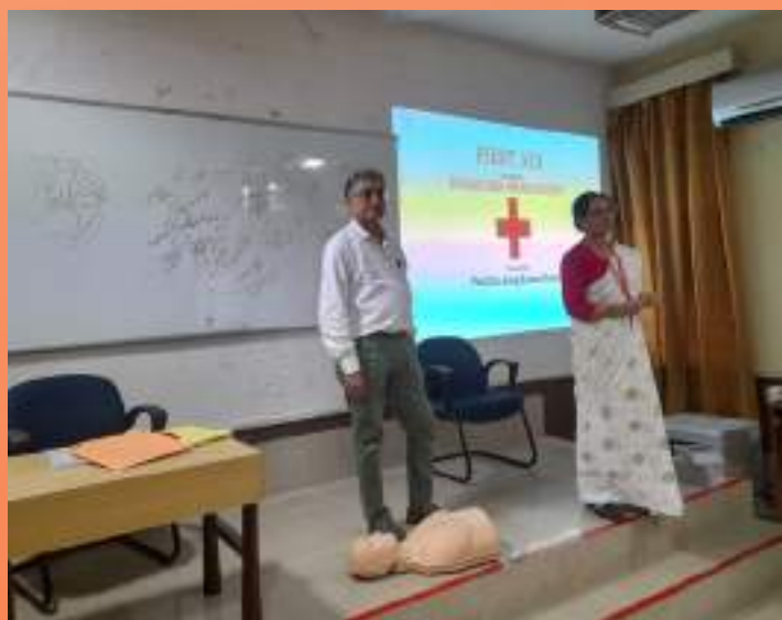
IRCS, West Bengal State Branch conducted first aid and disaster management training for the employees of NTPC Kahalgaon