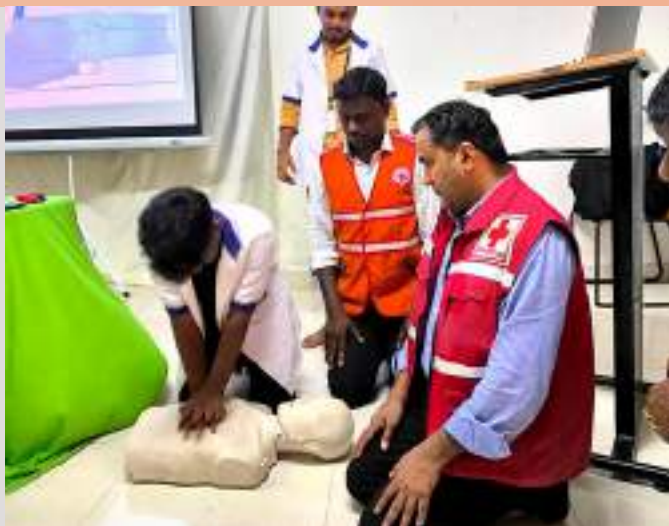
Training on BLS and First Aid for Paramedical students, IRCS Davengere District branch, Karnataka

THE DESIRE FOR THE WELL-BEING OF ONE'S OWN NATION CAN BE- AND MUST BE-MADE COMPATIBLE WITH THE WELFARE OF ALL HUMANITY.