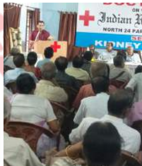
North 24 Parganas District Branch, West Bengal observed National Doctors Day