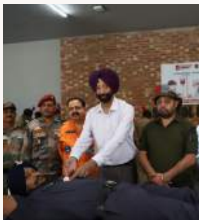
Indian Red Cross Society, Punjab State Branch, in collaboration with the NSS Department of Chandigarh University, organized a blood donation camp at the University campus.