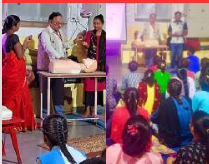
First aid training was organised by IRCS Pune District Branch, Maharashtra at Maher, shelter home, Pune