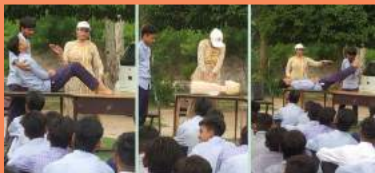
First aid awareness programme at Govt. Sec School Ismailpur Ambala, Haryana