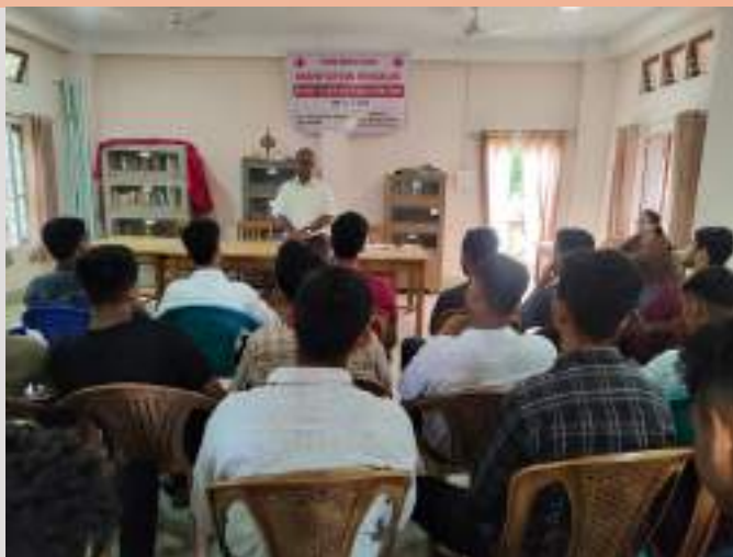
Darrang District Branch, IRCS organised orientation programme on first aid