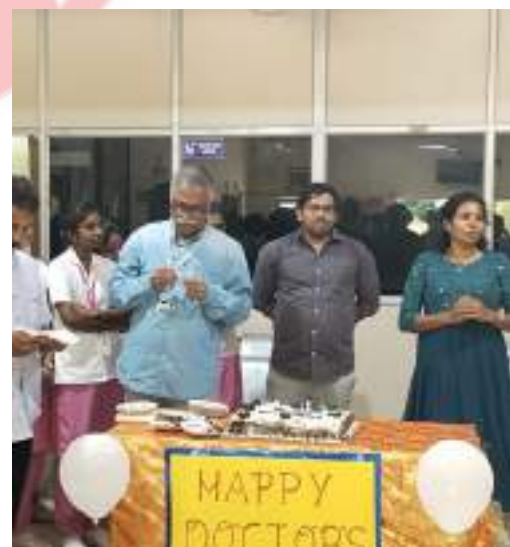
Celebration of National Doctors Day at IRCS Tamil Nadu State Branch