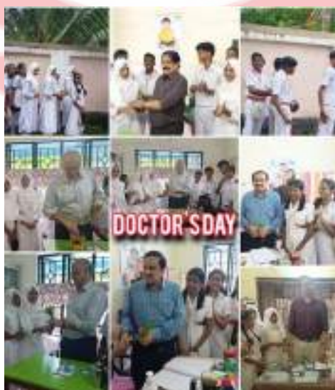
Celebration of National Doctors Day at Malippuram Hospital Vypin JRC unit Santa Cruz HS Ochanthuruth