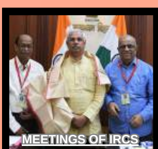
MEETINGS OF IRCS