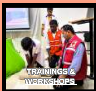
TRAININGS & WORKSHOPS