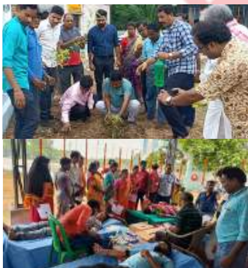
Dakshin Dinajpur District, Purulia District, Ghatal Sub Division branch, West Bengal observed National Doctors Day by holding blood donation camp and plantation drive.