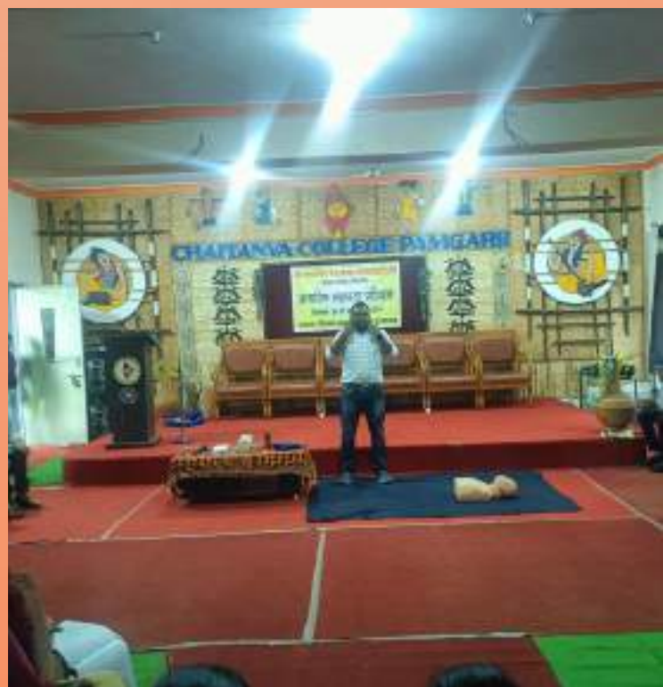
First Aid Training, IRCS, Janjgir, District Branch, Chhattisgarh