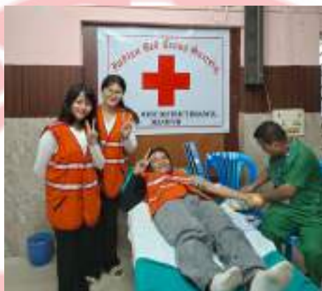
On National Doctors Day, the IRCS, Imphal West District Branch in collaboration with the Association of Voluntary Blood Donors, organized a voluntary blood donation drive at the Indian Medical Association Hall in Lamphel.