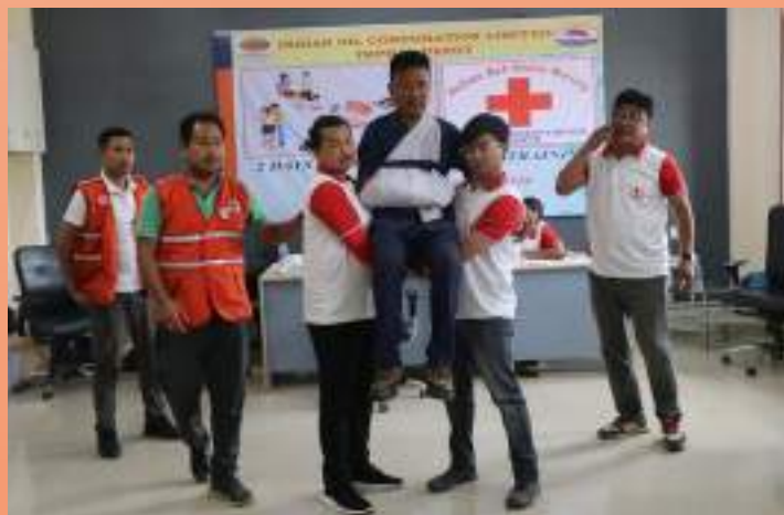
IRCS Imphal West district branch conducted first aid training for the employees and workers of IOCL Malom Oil Depot.

THE DESIRE FOR THE WELL-BEING OF ONE'S OWN NATION CAN BE- AND MUST BE-MADE COMPATIBLE WITH THE WELFARE OF ALL HUMANITY.