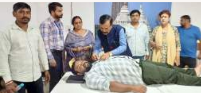
Blood donation camp organised By Chandra Shekhar Azad Charitable Trust Panchkula, Haryana in collaboration with the Haryana State Branch.