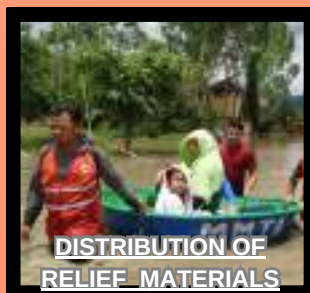
DISTRIBUTION OF RELIEF MATERIALS