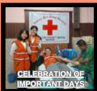
CELEBRATION OF IMPORTANT DAYS