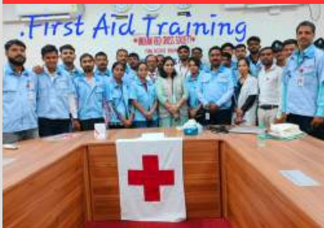
First aid training, Pune, Maharashtra