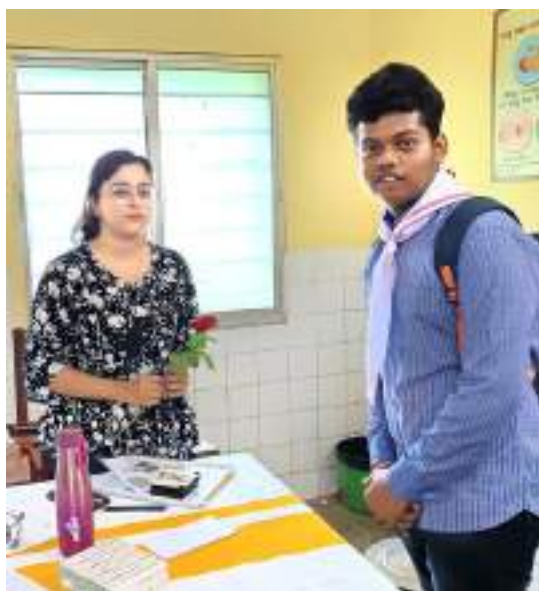
National Doctors Day celebration by Youth Red Cross of Boudh Panchayat College, Boudh, Odisha