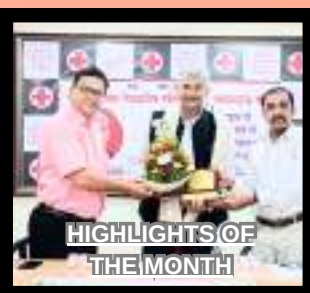
HIGHLIGHTS OF THE MONTH