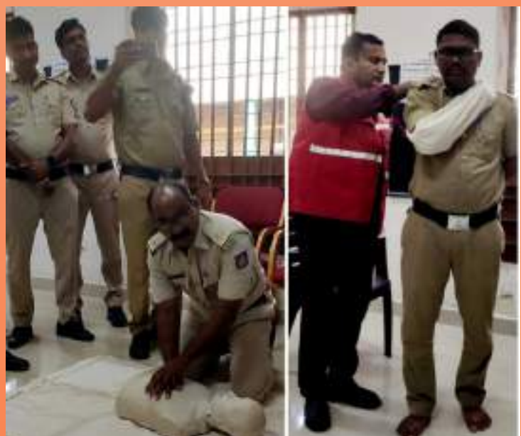
IRCS Chitradurga District branch, Karnataka conducted first aid/CPR training for jail police personnel.