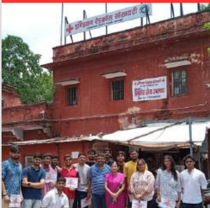
Students from BITS Pilani successfully completed their 2-month summer internship at the Indian Red Cross Society, Rajasthan State Branch.

THE EARTH IS THE CRADLE OF HUMANITY, BUT MANKIND CANNOT STAY IN THE CRADLE FOREVER.