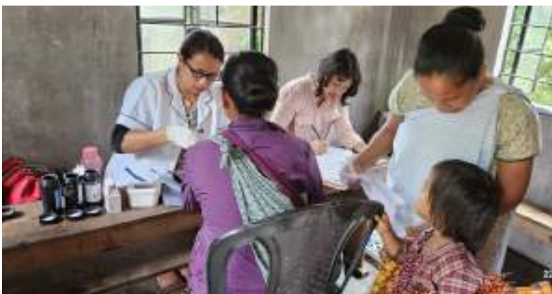
Medical Camp was held at Pynursla block Mynrieng Village, Goa