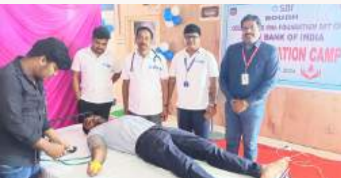
Voluntary Blood donation camp was held in SBI, Boudh on Bank Day, 01-07-24 in support of District Red Cross branch, Boudh, Odisha.