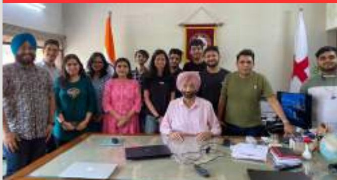
Students from BITS Pilani successfully completed their 2-month summer internship at the Indian Red Cross Society, Punjab State Branch