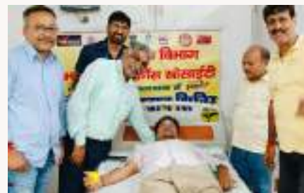
Blood donation camp, Munger, Bihar

EMPATHY IN ACTION: WHERE EVERY DONATION BECOMES A LIFELINE.