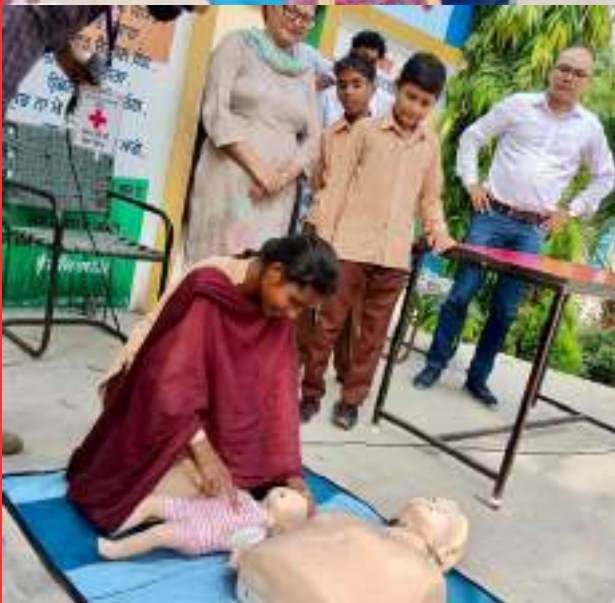
The Indian Red Cross Society, Bathinda district branch, extended its humanitarian efforts in the rural sector by conducting a first aid training program for students of Government School at Village Buladevala.

THE DESIRE FOR THE WELL-BEING OF ONE'S OWN NATION CAN BE- AND MUST BE-MADE COMPATIBLE WITH THE WELFARE OF ALL HUMANITY.