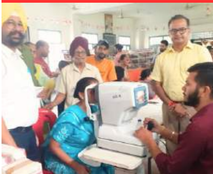
Indian Red Cross Society, Punjab State Branch, Chandigarh, in collaboration with Indian Red Society, Amritsar; Bharat Vikas Parishar; Modern Jagat Jyoti School and R.P Education Society, organized a Mega Health Checkup and TB Screening Camp at Modern Jagat Jyoti School, Jaura Phatak, Amritsar.