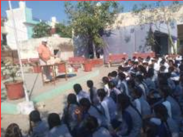
First Aid Training, School of Gurugram, Haryana.