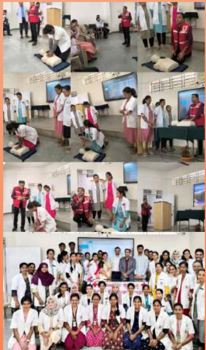
Training on Basic Life Support (BLS) and Management of other Emergencies for Ayurvedic Medical Students at Ashwini Ayurvedic Medical College, Davengere, Karnataka

THE EARTH IS THE CRADLE OF HUMANITY, BUT MANKIND CANNOT STAY IN THE CRADLE FOREVER.