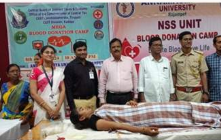
IRCS A.P.State Branch organized Blood Donation camp in association with GST department and created International Wonder book of records and Guinness Book of Records on 8.8.2024. The Blood Donation camps were conducted across the state and 4,141 units of blood was collected.