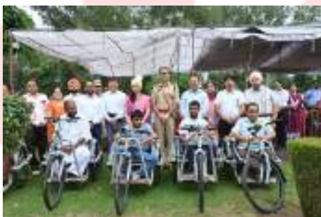
IRCS, Hoshiarpur, District Branch, Punjab distributed 10 motorized tricycles and 02 manual tricycles to physically challenged individuals, promoting mobility. Academic excellence was also celebrated, as 5 meritorious students from medical and non-medical streams received medals, certificates, and award money of Rs. 10,000 each.