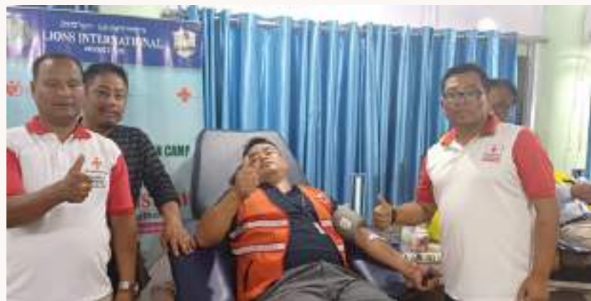
Blood donation camp at Dept of Transfusion Medicine, RIMS, was held by IRCS Imphal West district branch, Manipur