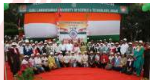
Youth Red Cross (YRC) unit at Guru Jambheshwar University, Hisar Celebrated Independence Day 2024 by establishing First Aid Post