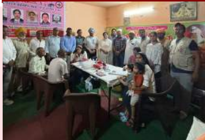
The Indian Red Cross Society, Punjab State, Jalandhar Branch, recently organized a comprehensive eye check camp, benefiting 350 patients. The camp provided free eye check up, distribution of eye drops, and on-the-spot cataract surgeries.