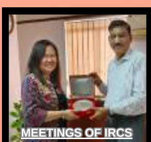
MEETINGS OF IRCS