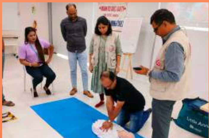
First aid training at Citec Engineering India Pvt.Ltd. Mumbai

IRCS, Punjab State Branch, and its districts have taken steps towards creating a safer and more resilient community by organizing First Aid Training and Awareness sessions at various locations (Chandigarh University, Barnala and Jalandhar district branch) across the state.