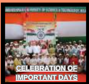
CELEBRATION OF IMPORTANT DAYS