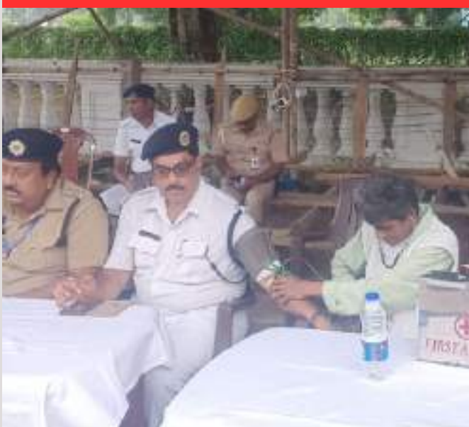
IRCS, South 24 Parganas District Branch, West Bengal held first aid cum medical camp at Red Road, Salt lake Stadium, Haj House, Kolkata.

THE EARTH IS THE CRADLE OF HUMANITY, BUT MANKIND CANNOT STAY IN THE CRADLE FOREVER.