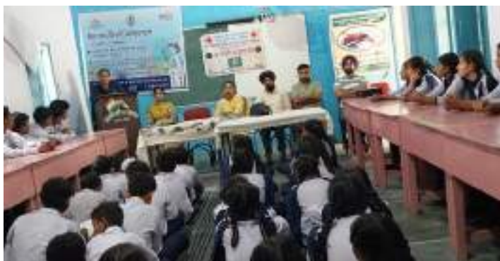
The Red Cross Drug De-Addiction and Rehabilitation Center, Punjab State, Nawanshahr organized a drug awareness camp at Government High School, Shahabpur