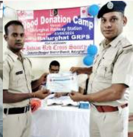
Blood donation camp by Dakshin Dinajpur district branch at Balurghat railway station, West Bengal.