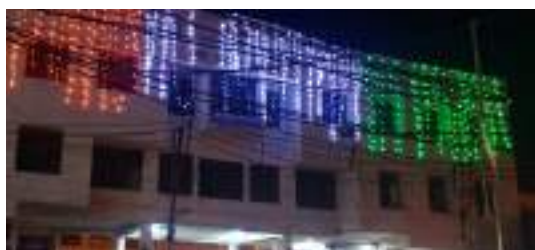
Red cross building illumination on Independence Day at Jammu