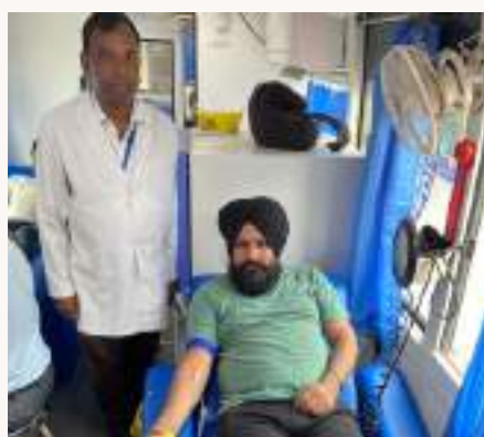
Blood donation camp, Punjab State District Branch Ludhiana