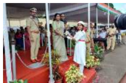
Independence Day celebration by Kerala State Branch.