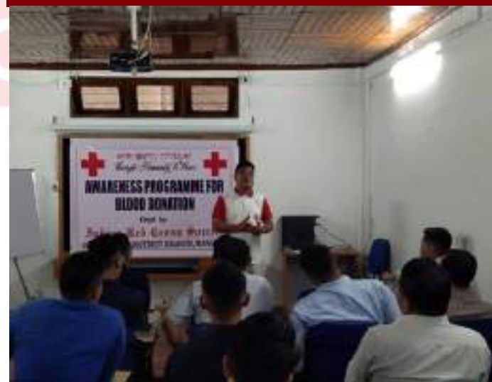
IRCS Imphal West district branch, Manipur organised awareness program for blood donation at JCRE Skill Solutions, Thangmeiband.