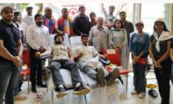
JC Bose YMCA University Faridabad, Haryana organised Voluntary Blood donation camp in its Campus.