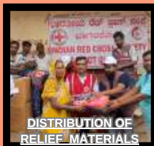
DISTRIBUTION OF RELIEF MATERIALS