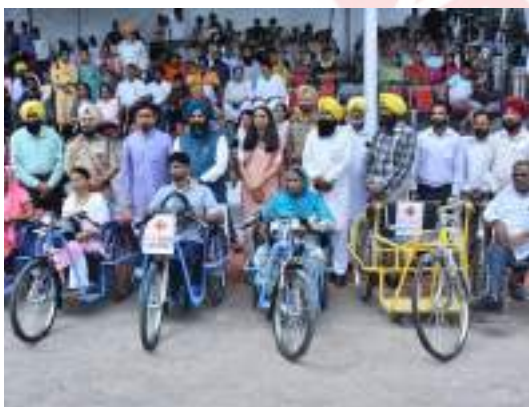
On the occasion of India's 78th Independence Day, the IRCS, Punjab, Ropar District Branch, organized an event to empower needy women and individuals with disabilities. Sewing machines were distributed to underprivileged women. In addition, tricycles were also distributed to individuals with disabilities.