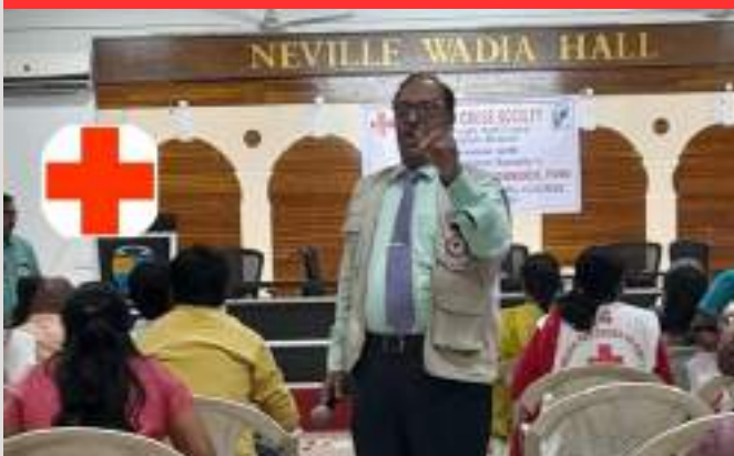
Councilors training program in First aid in Pune. 110 JRC /YRC councilors participated in the training program.