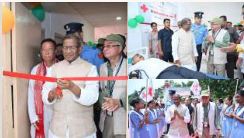
The Hon'ble Governor of Assam and the President of the Indian Red Cross Society, Assam State Branch, Shri Lakshman Prasad Acharya, inaugurated a blood donation camp today at the Red Cross Hospital in Chandmari, Guwahati.