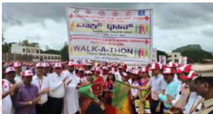
Walkathon was held by the IRCS Koppal district branch Karnataka. The theme for the Walkathon was WALK FOR HUMANITY!