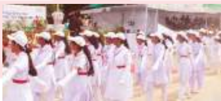
JRC Boys & Girls Unit Participated Dist. Level Ind. Day Parade at Keonjhar Odisha