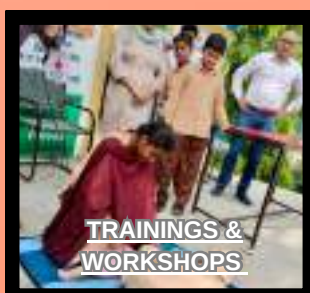
TRAININGS & WORKSHOPS