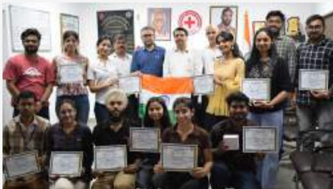
Final Year Students from the School of Public Health, Post Graduate Institute of Medical Sciences (PGIMS) Chandigarh completed their internship programme from Indian Red Cross Society, Haryana State Branch.