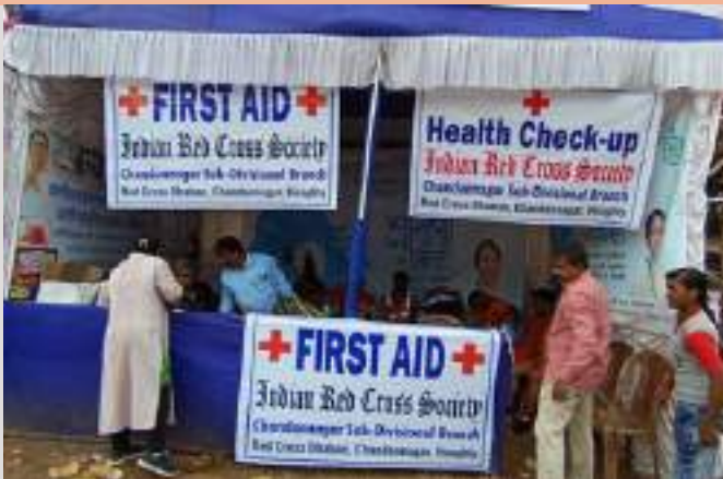
IRCS, Chandannagar Sub Division Branch, Hooghly organised first aid Post during Shrabani Mela on way to Tarakeswar, at Basudebpur, Haripal, Hooghly District