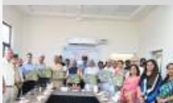
Hon'ble Governor-cum-President, Indian Red Cross Society, Haryana State Branch visited Maharshi Dayanand University, Rohtak for inaugurating Sardar Ballabh Bhai Patel Cricket Stadium and unvelling of Coffey Table Book Titled as Symphony of Wild Coffey created by environment sustainability management cell in association with the YRC Unit of MD University Rohtak. On this occasion a mega Tree Plantation derive 'Ek Ped Maa ke Naam' was also organised by YRC unit of the university.