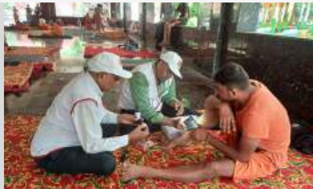
Indian Red Cross Society, Haryana State Branch through its District Red Cross Branches rendered special services for Kawad Pilgrims during Shravan month. Various First Aid Posts were established for the pilgrims