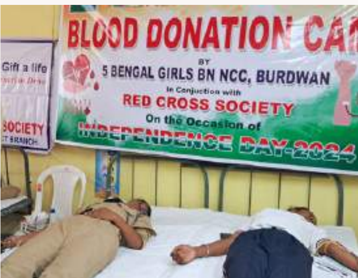
Blood donation camp, Burdwan, West Bengal