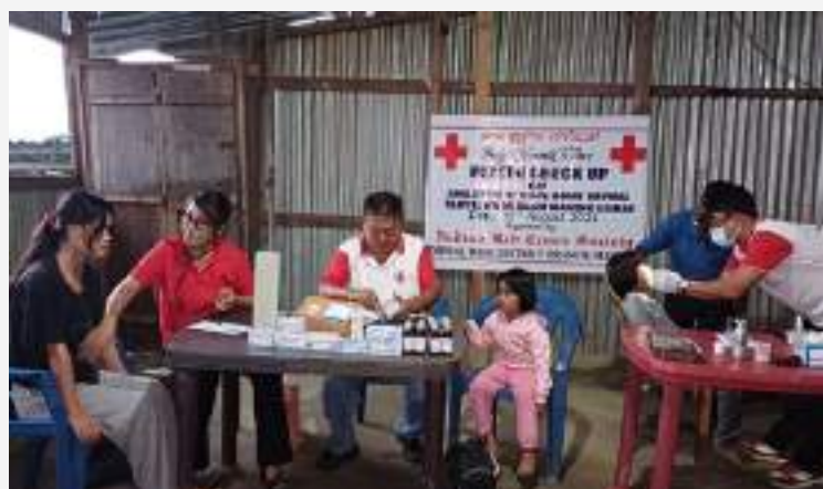
IRCS Imphal West District branch Manipur organised a health checkup program for children's of Hope Home, Imphal