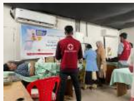
Blood donation camp, Kozhikode, Kerala

IRCS NHQ BLOOD CENTER TIMINGS FOR BLOOD DONATION: MONDAY- SATURDAY (EXCEPT 2ND SATURDAY): 9 AM - 7 PM 2ND SATURDAY, SUNDAY, PUBLIC HOLIDAYS: 10 AM - 6 PM NOTE: THE NHQ BLOOD CENTER IS OPEN 24/7 FOR ISSUE OF BLOOD