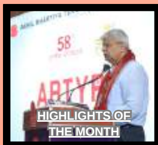
HIGHLIGHTS OF THE MONTH