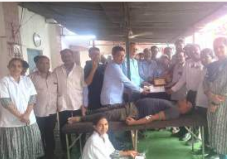
Blood donation camp was organized at Nilon's Company at Village Utaran, by Jalgaon District Red Cross Blood Center. 243 officers and employees donated blood in this camp.

EMPATHY IN ACTION: WHERE EVERY DONATION BECOMES A LIFELINE.