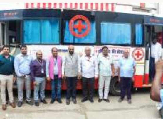
Blood donation camp, Patna, Bihar