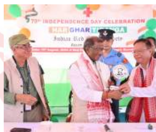
The Hon'ble Governor of Assam and the President of the Indian Red Cross Society, Assam State Branch, Shri Lakshman Prasad Acharya, inaugurated a blood donation camp