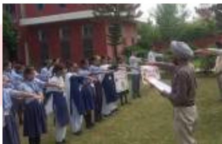
IRCS, Punjab State Branch run Drug de-addiction & Rehabilitation Centre Nawasheher organized Awareness Session on Drug Abuse on 78th Independence Day