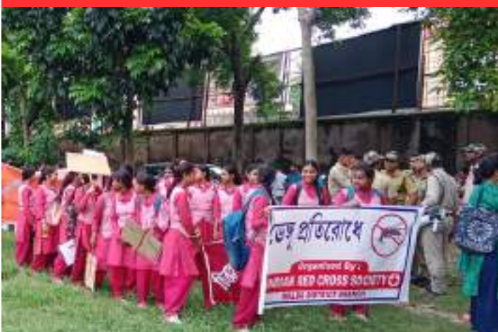
IRCS Malda District Branch, West Bengal participated in Dengue awareness rally organized by district administration.