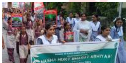
IRCS, Punjab State Branch Drug de-addiction & Rehabilitation Centre, Patiala organized rally against drug abuse in Patiala