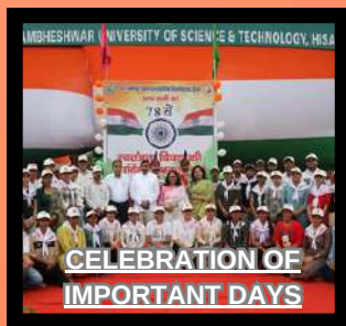
CELEBRATION OF IMPORTANT DAYS