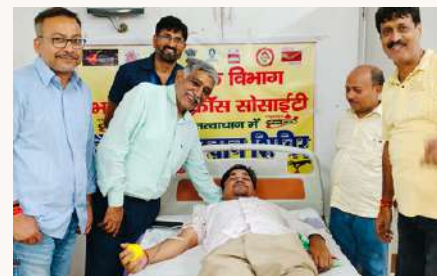
Blood donation camp, Munger, Bihar

EMPATHY IN ACTION: WHERE EVERY DONATION BECOMES A LIFELINE.