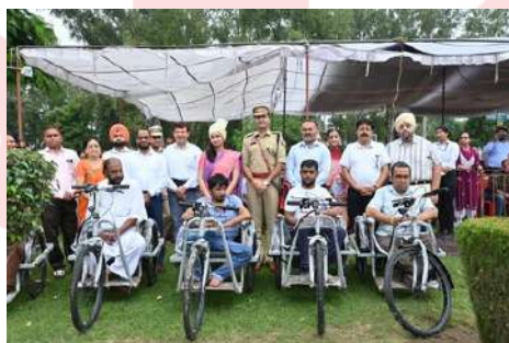
IRCS, Hoshiarpur, District Branch, Punjab distributed 10 motorized tricycles and 02 manual tricycles to physically challenged individuals, promoting mobility. Academic excellence was also celebrated, as 5 meritorious students from medical and non-medical streams received medals, certificates, and award money of Rs. 10,000 each.