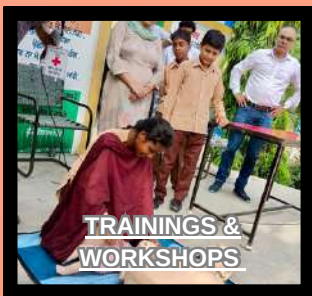
TRAININGS & WORKSHOPS