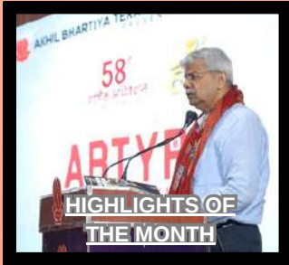
HIGHLIGHTS OF THE MONTH