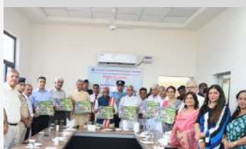
Hon'ble Governor-cum-President, Indian Red Cross Society, Haryana State Branch visited Maharshi Dayanand University, Rohtak for inaugurating Sardar Ballabh Bhai Patel Cricket Stadium and unveling of Coffey Table Book Titled as Symphony of Wild Coffey created by environment sustainability management cell in association with the YRC Unit of MD University Rohtak. On this occasion a mega Tree Plantation derive 'Ek Ped Maa ke Naam' was also organised by YRC unit of the university.