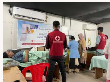
Blood donation camp, Kozhikode, Kerala

IRCS NHQ BLOOD CENTER TIMINGS FOR BLOOD DONATION: MONDAY- SATURDAY (EXCEPT 2ND SATURDAY): 9 AM - 7 PM 2ND SATURDAY, SUNDAY, PUBLIC HOLIDAYS: 10 AM - 6 PM NOTE: THE NHQ BLOOD CENTER IS OPEN 24/7 FOR ISSUE OF BLOOD