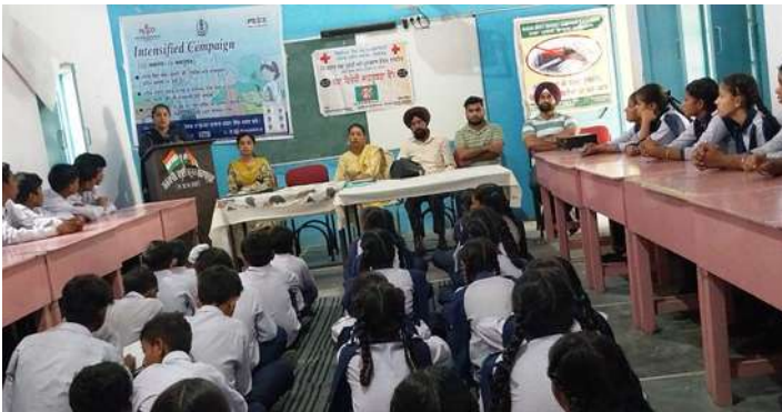
The Red Cross Drug De-Addiction and Rehabilitation Center, Punjab State, Nawanshahr organized a drug awareness camp at Government High School, Shahabpur