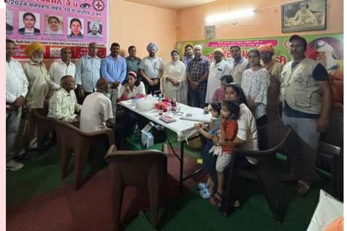
The Indian Red Cross Society, Punjab State, Jalandhar Branch, recently organized a comprehensive eye check camp, benefiting 350 patients. The camp provided free eye check up, distribution of eye drops, and on-the-spot cataract surgeries.