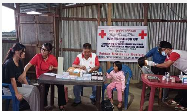
IRCS Imphal West District branch Manipur organised a health checkup program for children's of Hope Home, Imphal