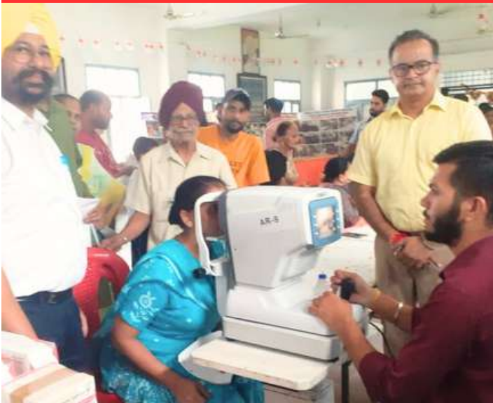
Indian Red Cross Society, Punjab State Branch, Chandigarh, in collaboration with Indian Red Society, Amritsar; Bharat Vikas Parishad; Modern Jagat Jyoti School and R.P Education Society, organized a Mega Health Checkup and TB Screening Camp at Modern Jagat Jyoti School, Jaura Phatak, Amritsar.