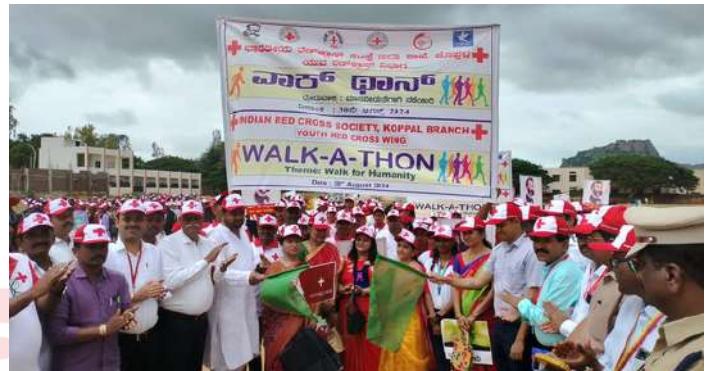
Walkathon was held by the IRCS Koppal district branch Karnataka. The theme for the Walkathon was WALK FOR HUMANITY!