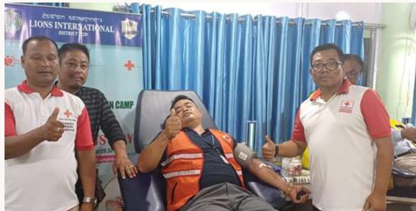
Blood donation camp at Dept of Transfusion Medicine, RIMS, was held by IRCS Imphal West district branch, Manipur