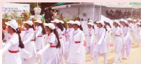
JRC Boys & Girls Unit Participated Dist. Level Ind. Day Parade at Keonjhar Odisha