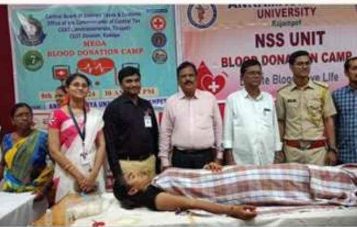
IRCS A.P.State Branch organized Blood Donation camp in association with GST department and created International Wonder book of records and Guinness Book of Records on 8.8.2024. The Blood Donation camps were conducted across the state and 4,141 units of blood was collected.