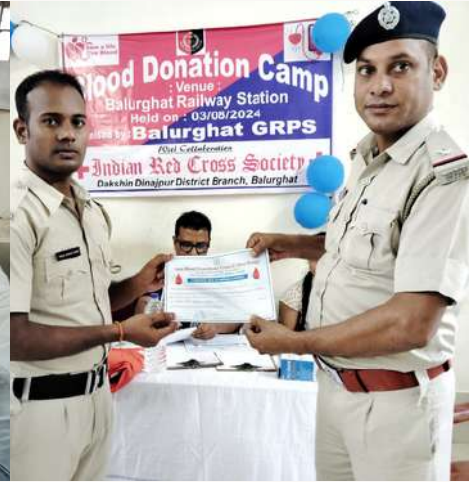
Blood donation camp by Dakshin Dinajpur district branch at Balurghat railway station, West Bengal.