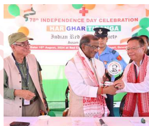
The Hon'ble Governor of Assam and the President of the Indian Red Cross Society, Assam State Branch, Shri Lakshman Prasad Acharya, inaugurated a blood donation camp