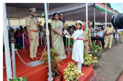
Independence Day celebration by Kerala State Branch.