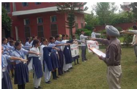
IRCS, Punjab State Branch run Drug de-addiction & Rehabilitation Centre Nawasheher organized Awareness Session on Drug Abuse on 78th Independence Day