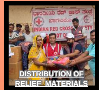
DISTRIBUTION OF RELIEF MATERIALS