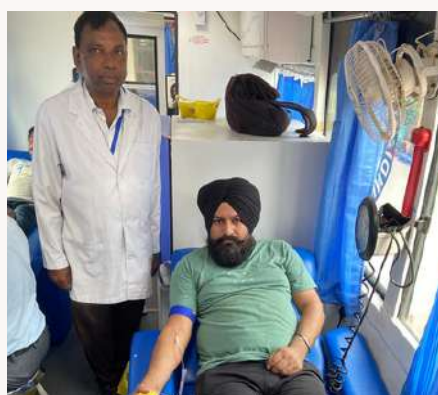
Blood donation camp, Punjab State District Branch Ludhiana