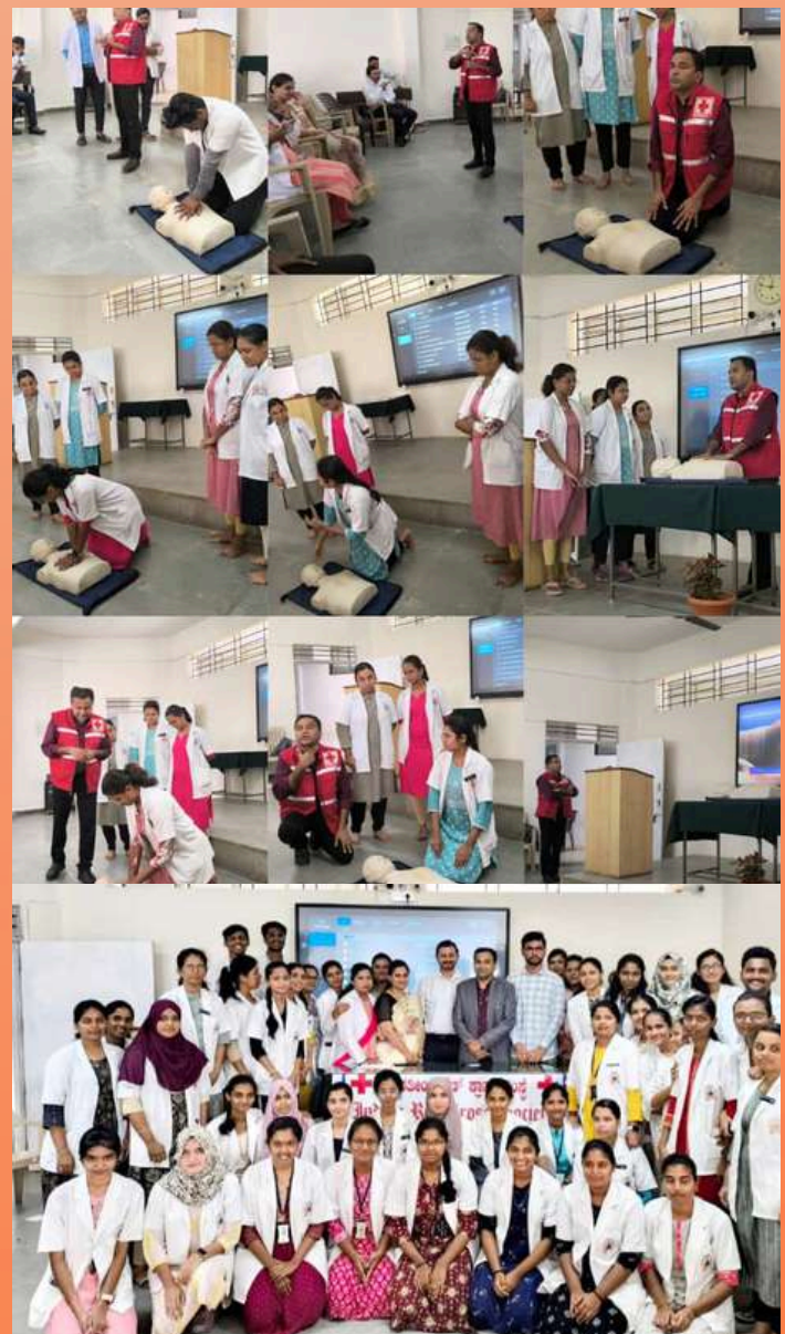
Training on Basic Life Support (BLS) and Management of other Emergencies for Ayurvedic Medical Students at Ashwini Ayurvedic Medical College, Davengere, Karnataka

THE EARTH IS THE CRADLE OF HUMANITY, BUT MANKIND CANNOT STAY IN THE CRADLE FOREVER.