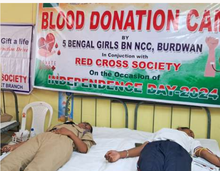
Blood donation camp, Burdwan, West Bengal

EMPATHY IN ACTION: WHERE EVERY DONATION BECOMES A LIFELINE.