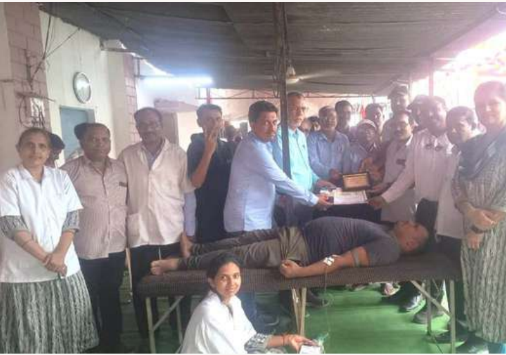
Blood donation camp was organized at Nilon's Company at Village Utaran, by Jalgaon District Red Cross Blood Center. 243 officers and employees donated blood in this camp.