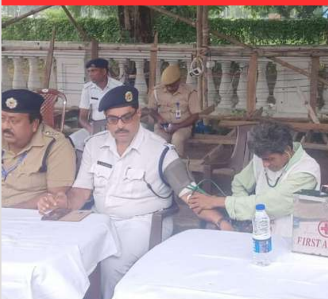
IRCS, South 24 Parganas District Branch, West Bengal held first aid cum medical camp at Red Road, Salt lake Stadium, Haj House, Kolkata.

THE EARTH IS THE CRADLE OF HUMANITY, BUT MANKIND CANNOT STAY IN THE CRADLE FOREVER.