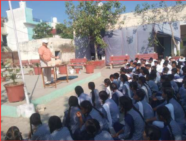
First Aid Training, School of Gurugram, Haryana.