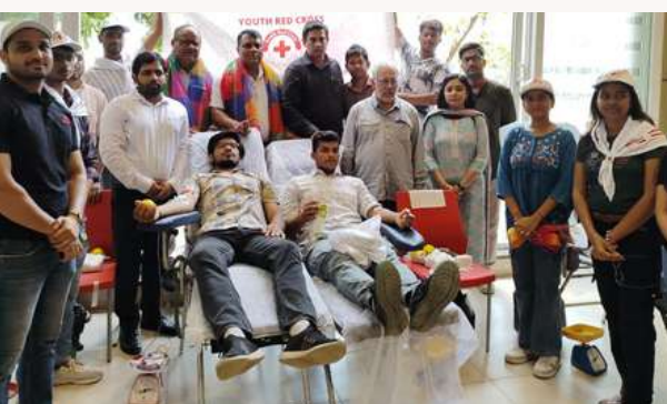
JC Bose YMCA University Faridabad, Haryana organised Voluntary Blood donation camp in its Campus.