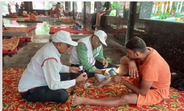
Indian Red Cross Society, Haryana State Branch through its District Red Cross Branches rendered special services for Kawad Pilgrims during Shravan month. Various First Aid Posts were established for the pilgrims