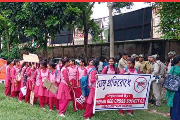
IRCS Malda District Branch, West Bengal participated in Dengue awareness rally organized by district administration.