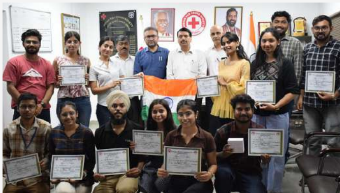
Final Year Students from the School of Public Health, Post Graduate Institute of Medical Sciences (PGIMS) Chandigarh completed their internship programme from Indian Red Cross Society, Haryana State Branch.