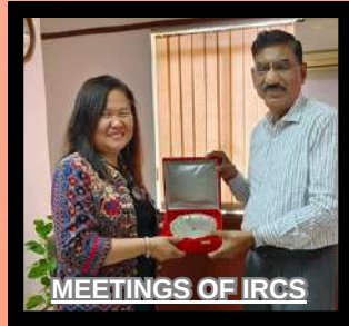
MEETINGS OF IRCS