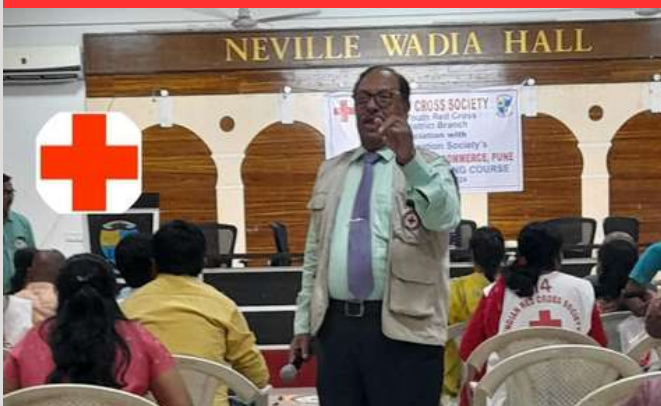
Councilors training program in First aid in Pune. 110 JRC /YRC councilors participated in the training program.