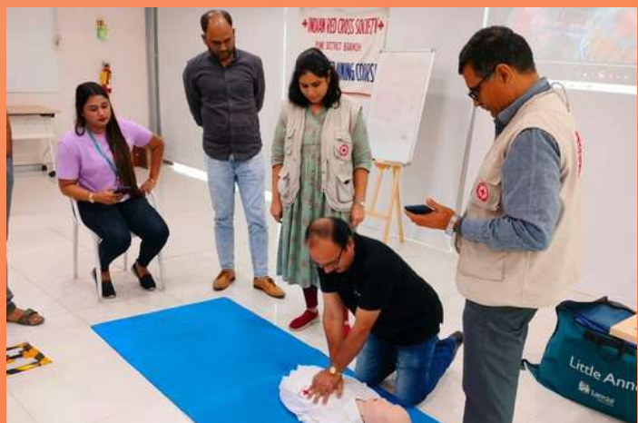
First aid training at Citec Engineering India Pvt.Ltd. Mumbai

IRCS, Punjab State Branch, and its districts have taken steps towards creating a safer and more resilient community by organizing First Aid Training and Awareness sessions at various locations (Chandigarh University, Barnala and Jalandhar district branch) across the state.