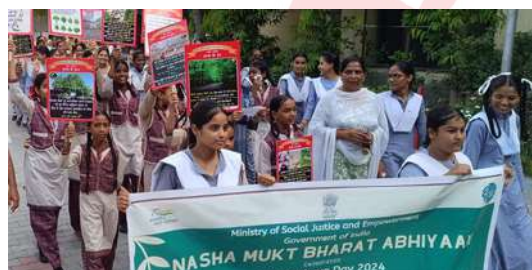
IRCS, Punjab State Branch Drug de-addiction & Rehabilitation Centre, Patiala organized rally against drug abuse in Patiala