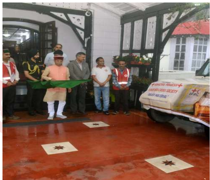
Hon'ble Governor & President of HP State Red Cross Society flagged off the 02 vehicles with relief material to the District Red Cross Branch Kullu.

During recent floods in Tripura , the volunteers of IRCS Tripura State branch continued playing a crucial role in providing emergency assistance and relief along with the local administration. Their activities included rescue operations, relief distribution and medical aid.