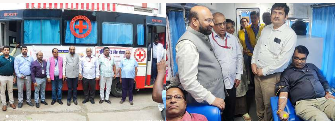
Blood donation camp, Patna, Bihar

EMPATHY IN ACTION: WHERE EVERY DONATION BECOMES A LIFELINE.