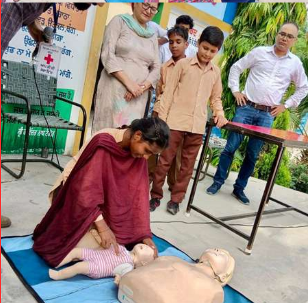
The Indian Red Cross Society, Bathinda district branch, extended its humanitarian efforts in the rural sector by conducting a first aid training program for students of Government School at Village Buladevala.

THE DESIRE FOR THE WELL-BEING OF ONE'S OWN NATION CAN BE- AND MUST BE-MADE COMPATIBLE WITH THE WELFARE OF ALL HUMANITY.