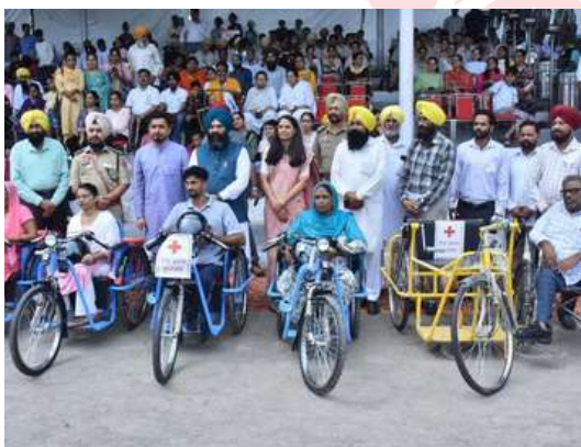
On the occasion of India's 78th Independence Day, the IRCS, Punjab, Ropar District Branch, organized an event to empower needy women and individuals with disabilities. Sewing machines were distributed to underprivileged women. In addition, tricycles were also distributed to individuals with disabilities.