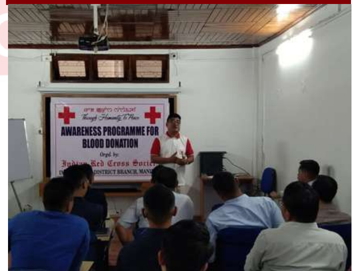
IRCS Imphal West district branch, Manipur organised awareness program for blood donation at JCRE Skill Solutions, Thangmeiband.