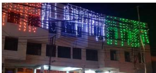
Red cross building illumination on Independence Day at Jammu