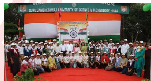
Youth Red Cross (YRC) unit at Guru Jambheshwar University, Hisar Celebrated Independence Day 2024 by establishing First Aid Post