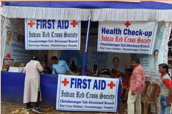
IRCS, Chandannagar Sub Division Branch, Hooghly organised first aid Post during Shrabani Mela on way to Tarakeswar, at Basudebpur, Haripal, Hooghly District