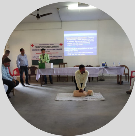
An Orientation Program on (YABC) organised by IRCs, Darrang District, Assam at Mangaldai College on 12.11.2020.