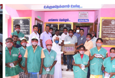
Ramnad district, Tamil Nadu