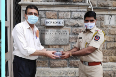
Corona warriors- Mumbai Maharashtra