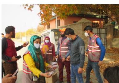
Jammu & Kashmir