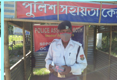
Traffic Police- Jirania Tripura