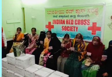
Flood Affected people, Chittapur Branch, West Bengal