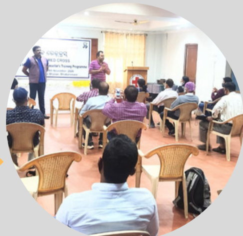
Training program of state level Untrained YRC counsellor from 17th to 19th Nov 2020 at Red Cross bhawan, Bhubaneswar, Odisha