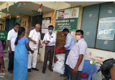
Front line Staffs at Mannivakkam Village Panchayat office, Chinglepet, Tamil Nadu