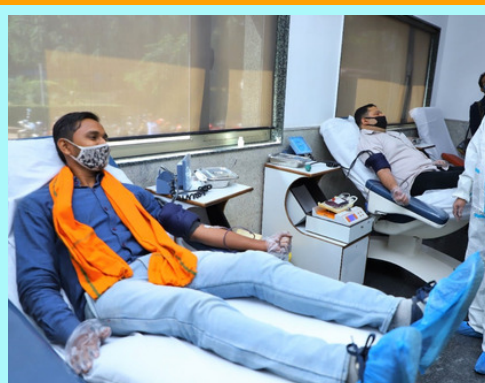
Voluntary Blood Donation Camp at IRCS, NHQ, Blood Centre