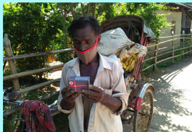
Rickshaw Puller - Jirania Tripura