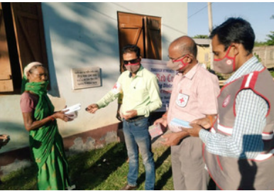
Tea Tribe, Darrang District Branch, Assam