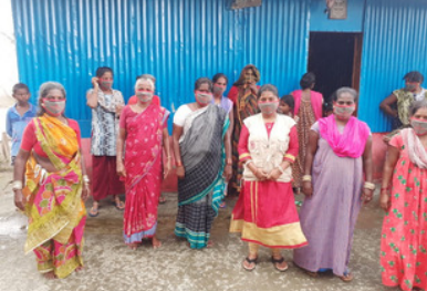
Fishermen, vegetable and meat sellers - Andaman & Nicobar Islands

Three major corporate donors to minimise the impact of Covid 19 to the Indian Red Cross have been Aramco, Aviva and Nestle. They together contributed about Rs 7.20 crores. Nhc procured cotton reusable masks and soaps from this donation which has been distributed almost all over the country.