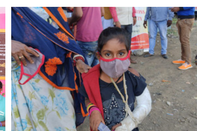
Bhopal, Madhya Pradesh