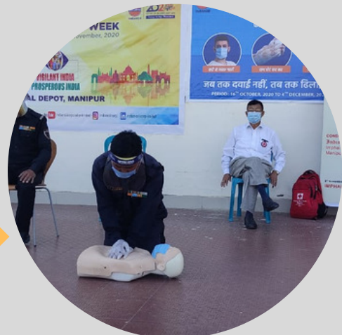
First Aid Training at Imphal Depot Manipur - 09.11.2020