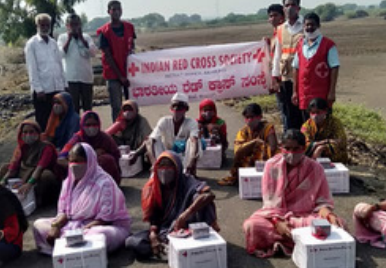
Redcross Afzalpur taluka branch district Kalburgi, Karnataka