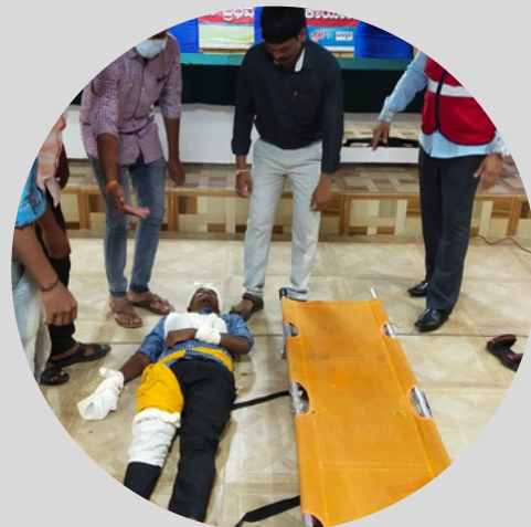
IRC's Ballari, Karnataka organised re-orientation training to SERV volunteers, for 3 days from 27th to 30th Nov 2020