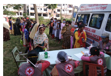
Girls, Women at Baranagar M&CW Centre- West Bengal