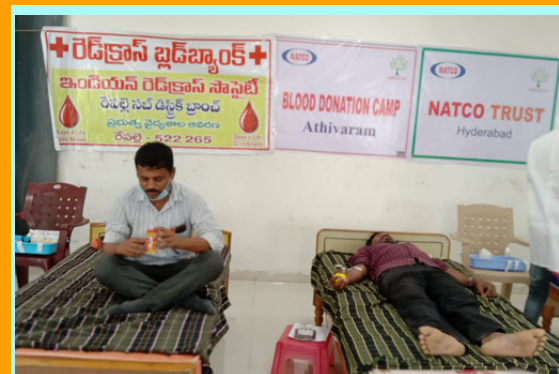
Voluntary Blood Donation Camp at Naidupet, Repalle, Andhra Pradesh Red Cross Branch

Thalassemia Screening and Counseling Centre at IRCS, NHQ provides Thalassemia (Minor) trait screening. Click here to fill Thalassemia (Minor) screening consent form