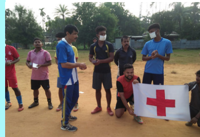
Football players- Jirania Tripura