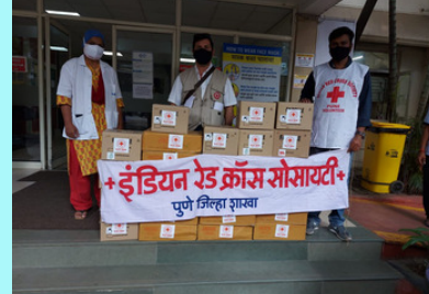
Corona warriors- Pune Maharashtra