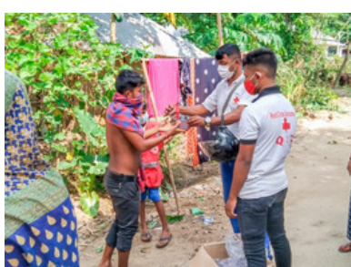
Sonamura - Tripura