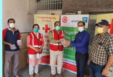
BMC workers as a part of "Swachata Mitra abhiyaan"-Madhya Pradesh