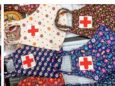
Odisha tailoring unit production

The International Day for Disaster Risk Reduction is a day to promote global culture of risk-awareness and disaster reduction. Held on every 13th October, the day celebrates how people and communities around the world are reducing their exposure to disasters and raising awareness about the importance of reducing the risks that they face.