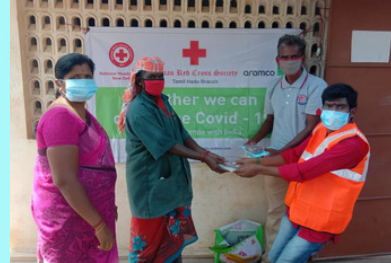
Karur- Tamil Nadu