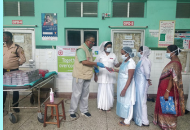
Health workers- Port Blair Andaman & Nicobar Islands