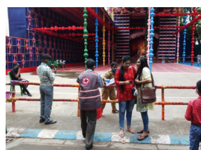
Durga Puja- West Bengal