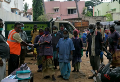
Sanitary workers- Krishnagiri, Tamil Nadu

Three major corporate donors to minimise the impact of Covid 19 to the Indian Red Cross have been Aramco, Aviva and Nestle. They together contributed about Rs 7.20 crores. NHQ procured cotton reusable masks and soaps from this donation which has been distributed almost all over the country.