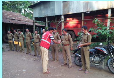
Traffic Police- Jirania Tripura