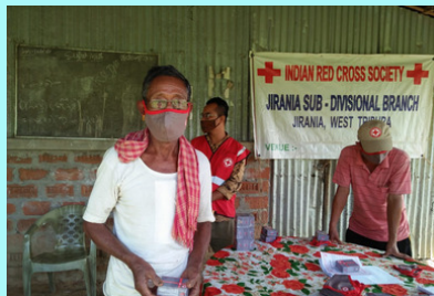
Farmers - Jirania Tripura