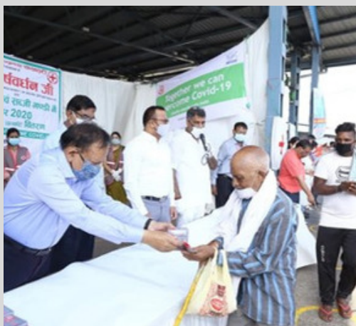
Hon'ble Minister MoHFW & Chairman, IRCS Dr. Harsh Vardhan distributing soaps and masks at Sabzi Mandi, Delhi