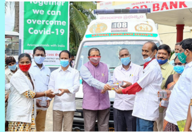
108 emergency ambulance employees- Warangal, Telangana