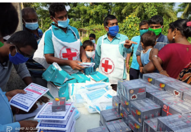
Chhota Shehara, North 24 Parganas- West Bengal