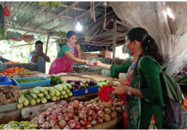
Fish, vegetables, Meat Sellers- Andaman & Nicobar Islands