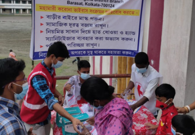
Sandeshkhali, North 24 Parganas- West Bengal