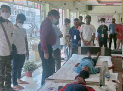
Blood donation camp-Tripura