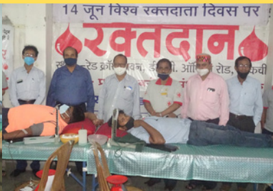
Blood donation camp-Jharkhand