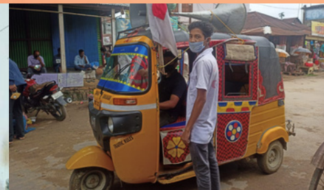
Publicity for covid testing, IRCS, Sonamura, Tripura