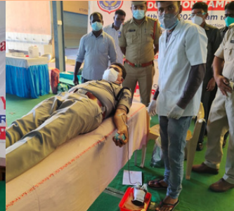
Blood donation camp-Telangana,