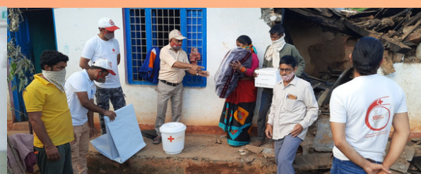
Volunteers of IRCS Bageshwar, Uttarakhand provided relief materials to the victims (whose houses collapsed) due to monsoon rain.