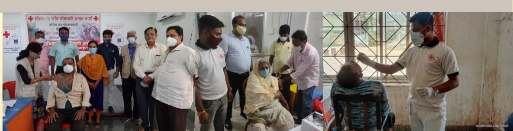
Vaccination drive, Barshi, Maharashtra