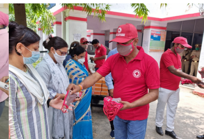
Distribution of Masks, Sitapur, IRCS UP