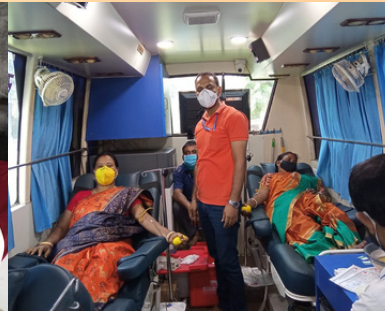
Blood donation camp-West Bengal