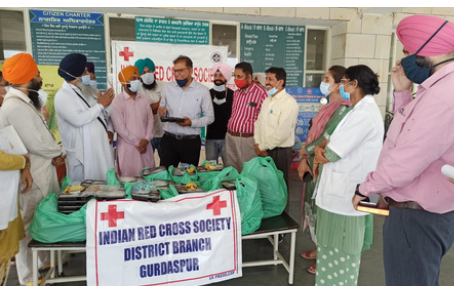
Free food scheme to patients admitted in Civil Hospital, Gurdaspur, IRCS Punjab