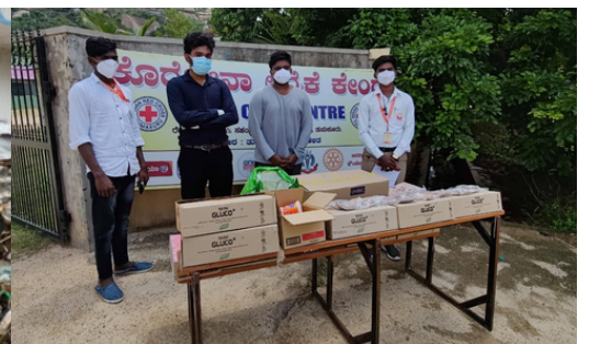
Distribution of Dry fruits, IRCS Karnataka