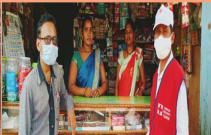
Awareness on vaccination drive, Dhamtari, Chhattisgarh