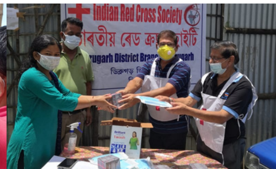
Distribution of Hygiene Material, Soaps and Masks - Assam