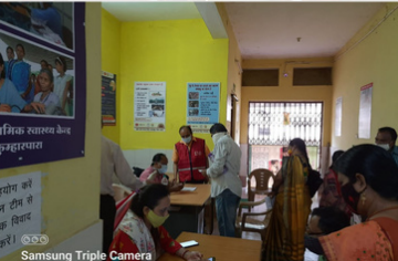
Vaccination drive, Jagdalpur, Chhattisgarh