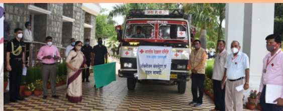
Honorable Governor of Uttarakhand flagged off Covid relief items and Buffer stock for upcoming monsoon season in the 6 districts of Uttarakhand