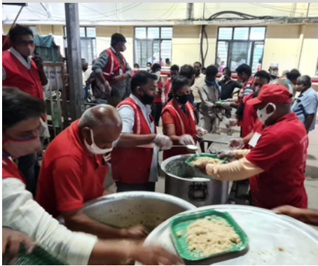
Distribution of cooked food IRCS Andhra Pradesh