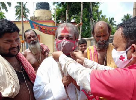
Distribution of Masks and Soaps -Puri,Odisha