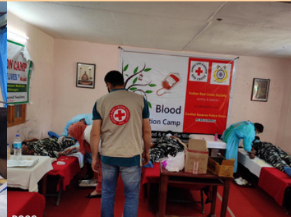
Blood donation camp-Jammu