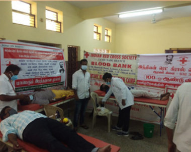
Blood donation camp-Chennai, Tamil Nadu