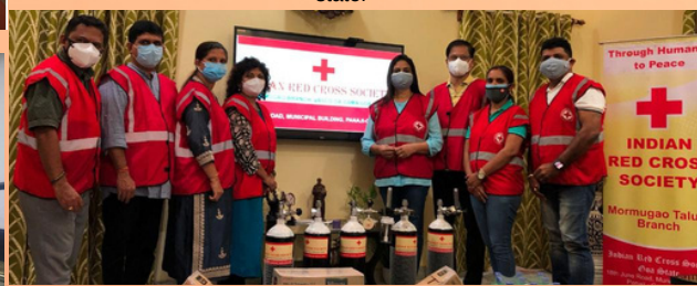
Oxygen cylinder distribution -IRCS Goa