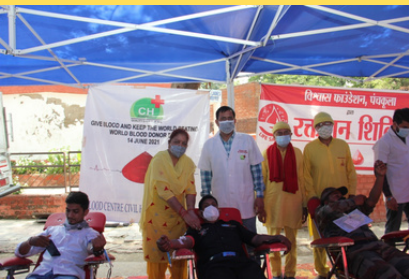
Blood donation camp-Punjab