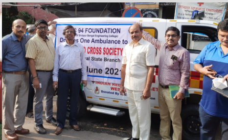
BEC 94 Foundation handed over Patient Transport Ambulance to IRCS West Bengal