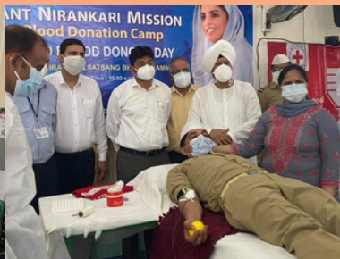
Blood donation camp-Jammu