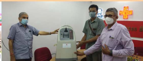
IRCS, Tamilnadu gave 10 litres of OC's to a 75-year-old patient for use and return from oxygen bank free of cost