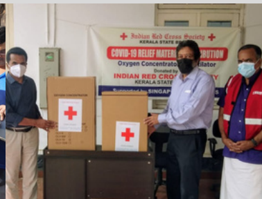
O2C and ventilators were handed over to the District Medical Officer at State HQ of IRCS - Kerala State Branch