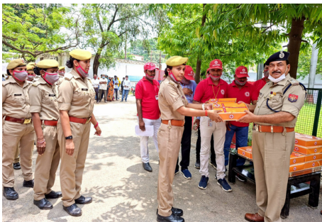
Distribution of Hygiene kits to women constables-Deoria, UP