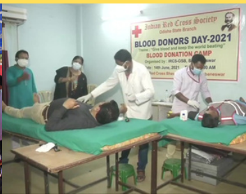
Blood donation camp-Odisha