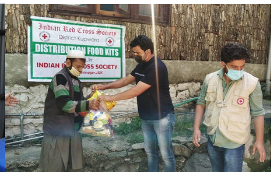
Distribution of Food Kits, IRCS Jammu