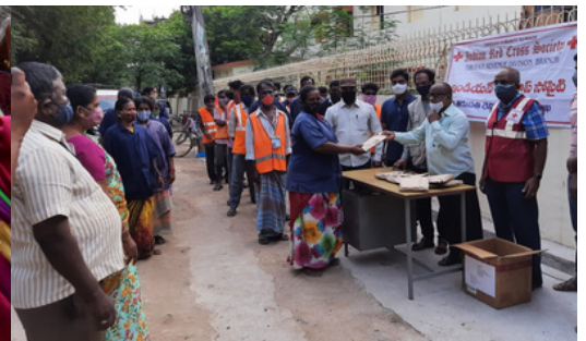
Distribution of Hygiene Kits, each with a sanitizer, masks, soap, hand gloves, and immunity sachets to 50 Municipal Sanitary Workers of Tirupati Revenue Division Branch, Andhra Pradesh