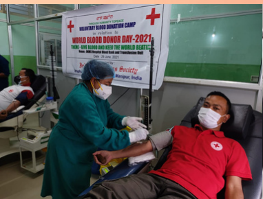
Blood donation camp-Manipur