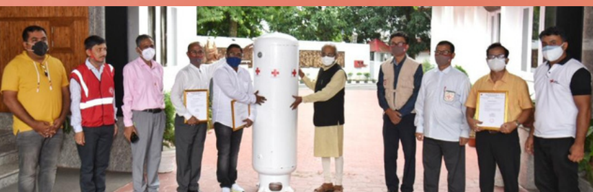
Oxygen Generator Handover Ceremony in presence of Hon'ble Governor of Assam and The President IRCS, Assam State branch to IRCS, Karimganj, Guwahati and Silchar district branch at Raj Bhavan, Guwahati