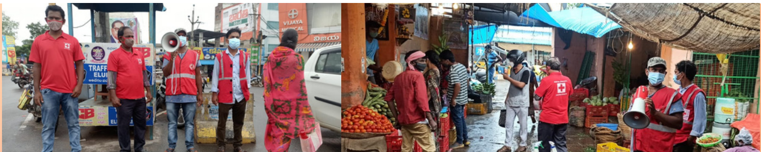
Awareness Campaign -Andhra Pradesh