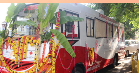
Rotary Bangalore South has donated 4 bedded a Brand new blood drawing bus worth of 46 lakhs to the Red Cross Blood Center Bengaluru.