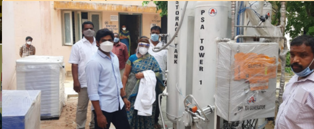
IRCS AP State established oxygen banks in all 13 blood centers in the state.