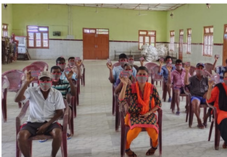
Distribution of Soaps -Andaman & Nicobar