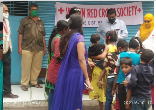
Distribution of cooked food -IRCS Pune, Maharashtra