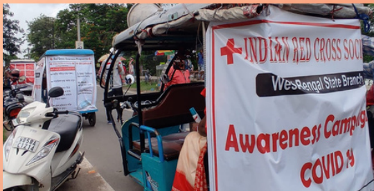
Awareness Campaign -West Bengal