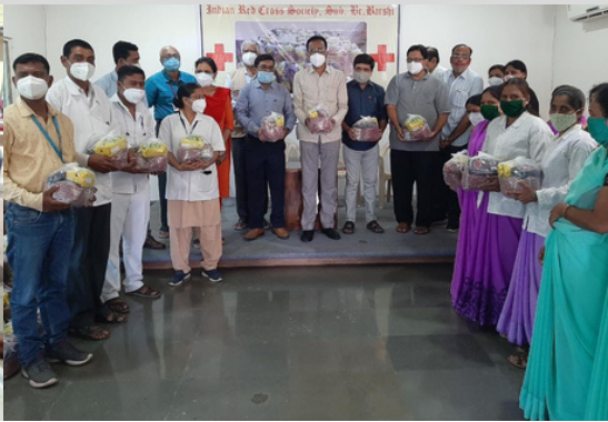
Distribution of tea, coffee, groundnuts to frontline health workers- Barshi sub district, IRCS Maharashtra