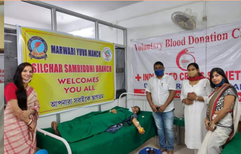
Blood donation camp-Silchar, Assam,