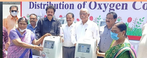
Telugu Association of North America (TANA) donated 100 oxygen Concentrators to Andhra Pradesh Red Cross