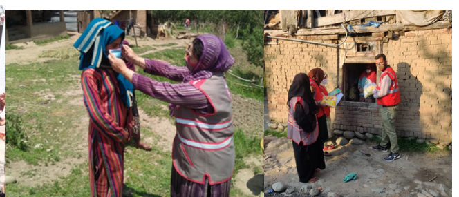
Distribution of Masks and food items, IRCS Jammu

We are grateful to all our Donors and Volunteers for their generous support for IRCS relief efforts on behalf of millions of underprivileged and vulnerable families struggling to survive in the aftermath of the COVID-19 Pandemic. Thank you for your compassion, patience, and contribution.