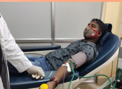
Blood donation camp-Assam