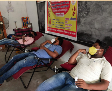
Blood donation camp-Chhattisgarh