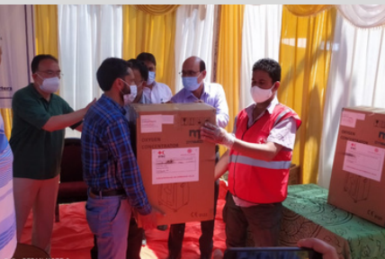
Additional commissioner, Kashmir division handed over oxygen concentrators for Covid 19 patients