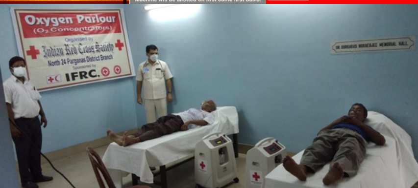
Oxygen Parlour NORTH 24 PARGANAS district branch ,West Bengal