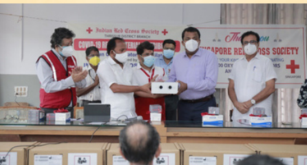
Oxygen Concentrators and ventilators distributed to IRCS, Kerala