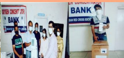
Ludhiana district branch started oxygen bank for covid patients