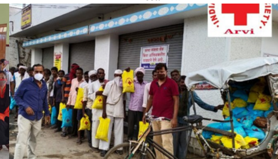
Distribution of Ration Kit -Arvi,IRCS Maharashtra