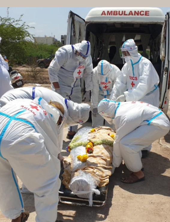
SERV/ SDRT Red Cross State Disaster Response Team volunteers, Bellary district branch, IRCS Karnataka participated in a training program on Dead Body Management and Cremation of patients died due to covid.