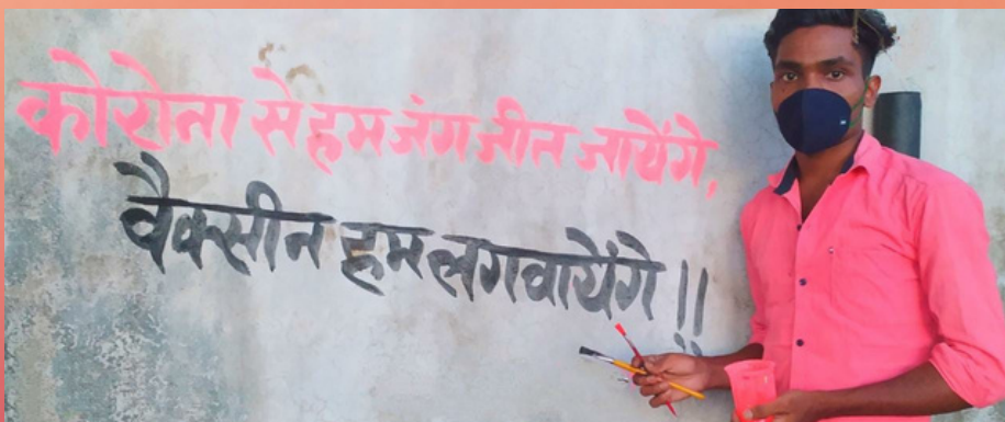
Awareness through wall painting Chhattisgarh