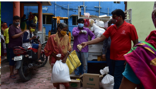
Distribution of Dry Ration for one month to the destitutes disabled and widows of Boudh district, Odisha