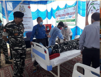
Blood donation camp at CRPF 161 BN Dalgate Srinagar, Jammu