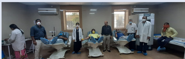
The medical & paramedical staff of the Pediatrics Department of a hospital in Durg donated blood during the lockdown on 25th April