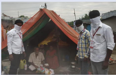
Volunteers in Telangana distributed dry ration among communities who have no source of income in the post lockdown period