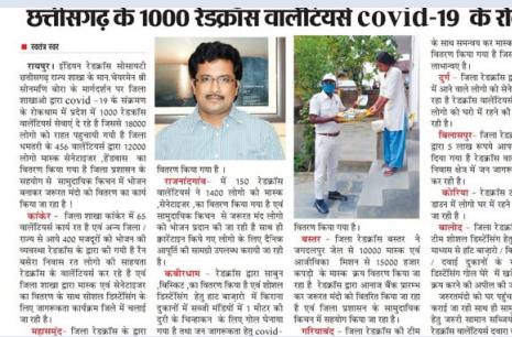
Volunteers in Chattisgarh are reaching the needy with essential relief aid such as food, masks & are also spreading awareness on COVID19