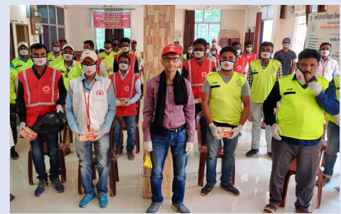
Armed with Red Cross masks provided by the State Branch, volunteers in Bihar are ready for action in the fight against COVID19!